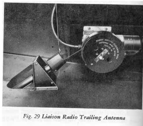
Fig. 29 Liaison Radio Trailing Antenna