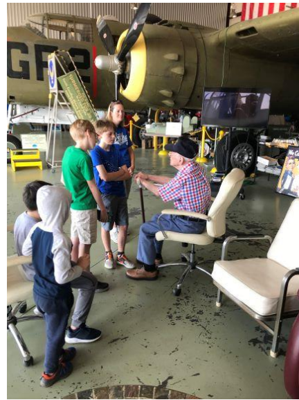
Alton talking to youth