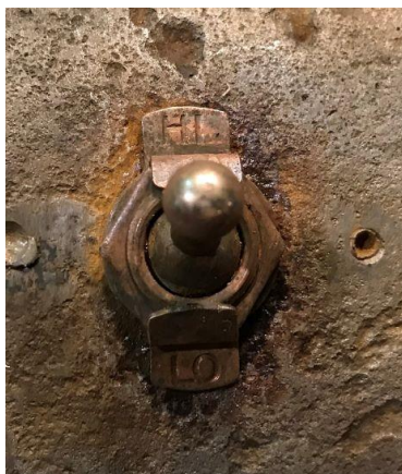
Switch still legible