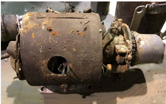
Before soaking in white vinegar

The newest area on GF2 to be cleaned is the crawlway above the bomb bay area. Two original instruments, Inverters, were removed from this area. The instruments were taken apart then soaked in white vinegar to remove the rust. After cleaning, the brass switch still works! Even the words "HI" and "LO" can be clearly seen on the inverters. These instruments will be cleaned and placed back in GF2.