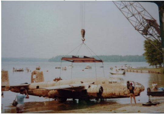
GF2 being lifted by the crane