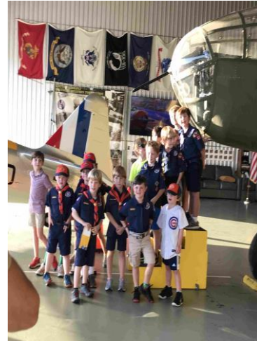
Excited future aviators from second group