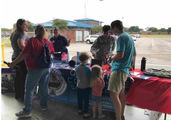
Civil Air Patrol Display

The focus of the October Open House was youth in aviation. Several people/groups helped to make the open house special. The Civil Air Patrol had a display to talk to youth about joining their organization. EAA Chapter 242 was also at the open house. Since 1993, they have participated in the Young Eagles program giving youth ages 8-17 a free introductory experience in general aviation which includes a 20-minute flight with a local volunteer pilot.