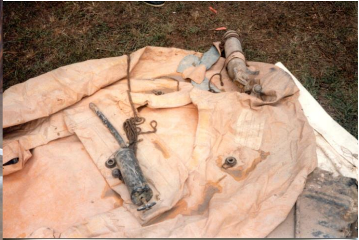
Life raft from GF2