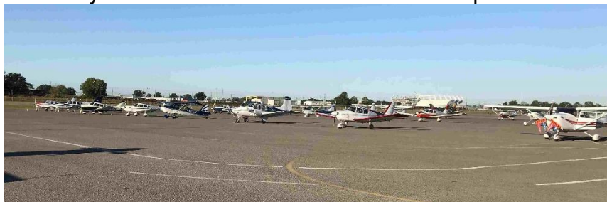
Lots of planes on the tarmac for the breakfast

SCHAF and EAA242 hosted the SC Breakfast Club in our hangar. The SC Breakfast Club meets every other Sunday at various airports around SC. Since 1938, pilots and aviation enthusiasts have enjoyed good food, great company, and amazing settings. It was a beautiful Sunday at the Jim Hamilton/Owen’s Field Airport.