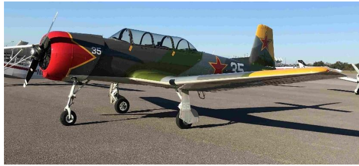
Nanchang CJ-6A (basic trainer) flew in for breakfast