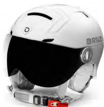
919 MATT SH PEARL WHITE