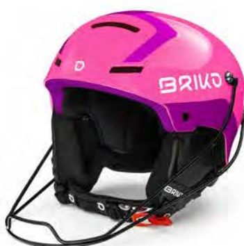
906 SHINY PINK VIOLE I

Slalom is composed by an outer ABS hard shell and made precious by higher range technical details. Thermal comfort is guaranteed by internal tunnels linking the front adjustable holes to the rear passive ones. Slalom's fit is the result of an adjustable 3D roll fit that allows a three dimensional fit setting for the best helmet wearability.