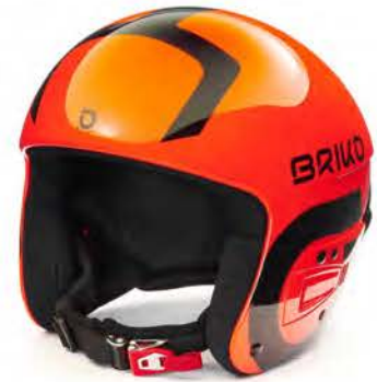
AOJ SHINY ORANGE - BLACK