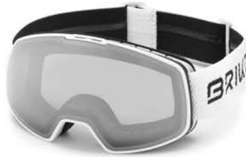
941 MATTI WHITE - SM2