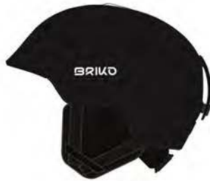
B7/ MATT | BLACK