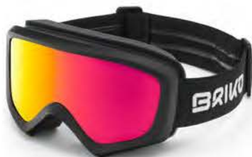
926 BLACK - RM3