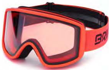
931 ORANGE FLUO - P1