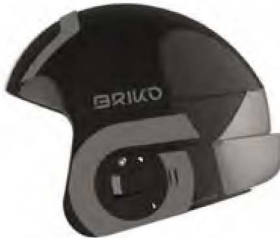
A09 SHINY BLACK - SILVER