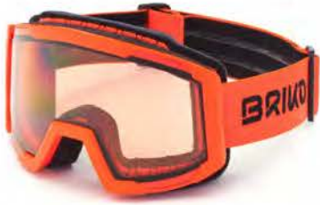
931 ORANGE FLUO - P1