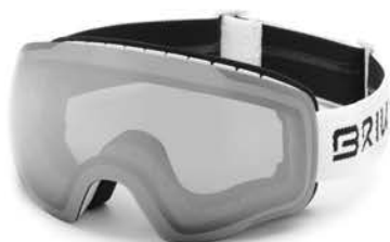
908 WHITE - SM3P1