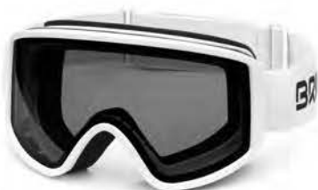
917 MATT WHITE - SM2