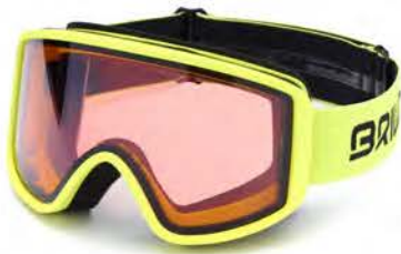
935 YELLOW FLUO - P1