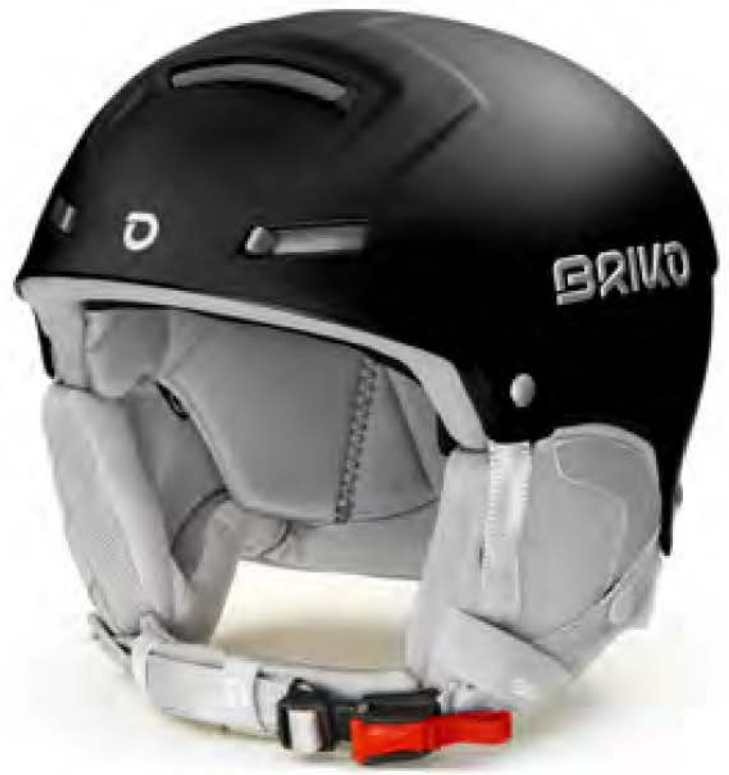
916 MATT BLACK

Giada is composed by an outer ABS hard shell and made precious by higher range technical details. Thermal comfort is guaranteed by internal tunnels linking the front adjustable holes to the rear passive ones. Giada's fit is the result of an adjustable 3D roll fit that allows a three dimensional fit setting for the best helmet wearability.