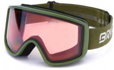
937 DEEP GREEN - P1