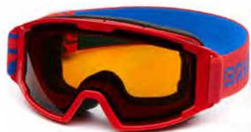
968 RED BLUE - BR2