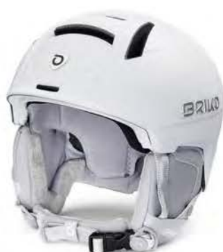
918 SHINY PEARL WHITE