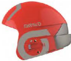
A01 SHINY RED SILVER