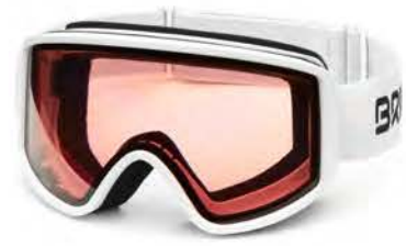
933 WHITE - P1