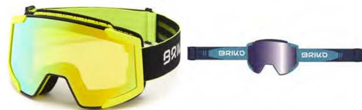
903 BLACK YELLOW-YM2