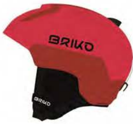
A01 MATT | RED RUMBLE - DEEP RED