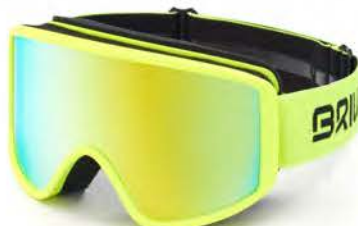
929 YELLOW FLUO - YM2