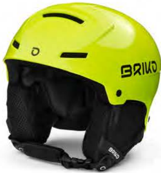
916 SHINY YELLOW FLUO