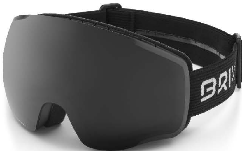
900 BLACK - SB3

The Kaba features a frameless construction for an unobstructed view, minimal distortion which improves reaction times and a modern design. Its state-of-the-art double spherical lens enables superb performances ensuring an extra wide 8.9 inches field of vision. The Flexa technology and its large size fit make the Kaba a versatile goggle, able to accommodate different face shapes. The goggles include a Full Mirror Multi-Layer double lens with anti-fog and anti-scratch treatment and 100% UV protection.