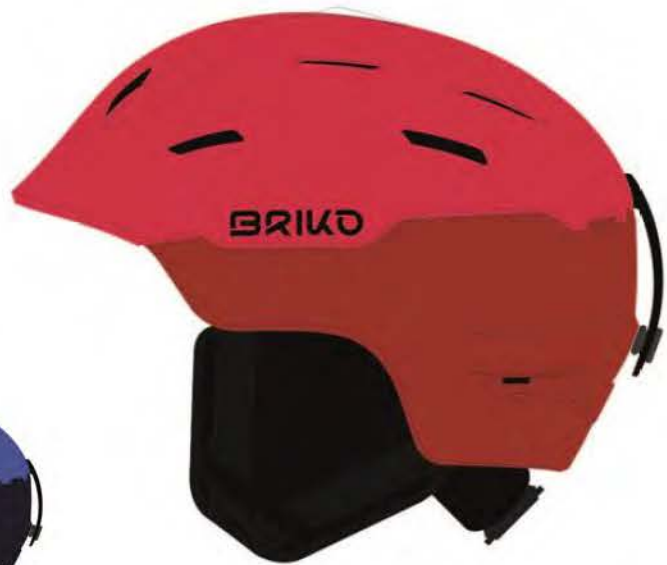
A00 MATT RED HOME - DEEP RED

Storm is characterised by 16 holes and by an active ventilation with 3 snaps in order to offer the maximum utilisation flexibility.