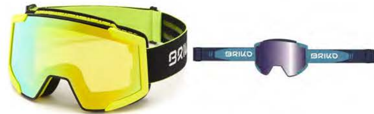
910 BLACK YELLOW F - YM2PT