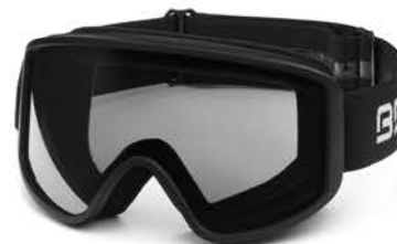
910 MATT BLACK - SM2