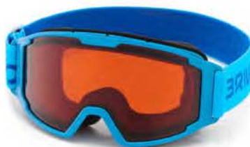
970 SKYBLUE - BR2