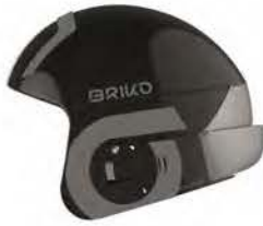
A0N SHINY BLACK - SILVER