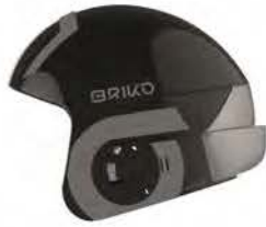
AON SHINY BLACK - SILVER