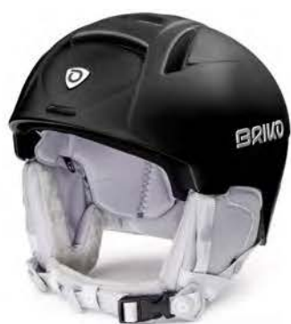
916 MATT BLACK