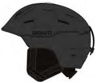
921 MATT GREY