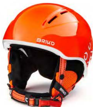
956 SHINY ORANGE FL. WHITE