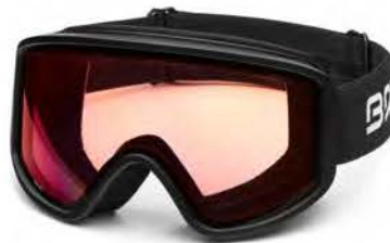
932 BLACK - P1