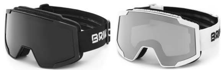
900 BLACK -SB3