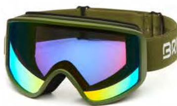
976 DEEP GREEN - YM2