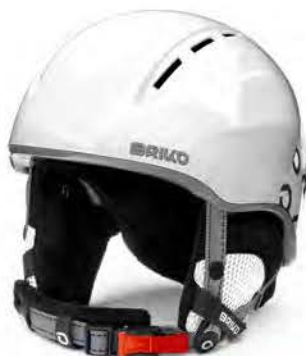
956 SHINY WHITE SILVER