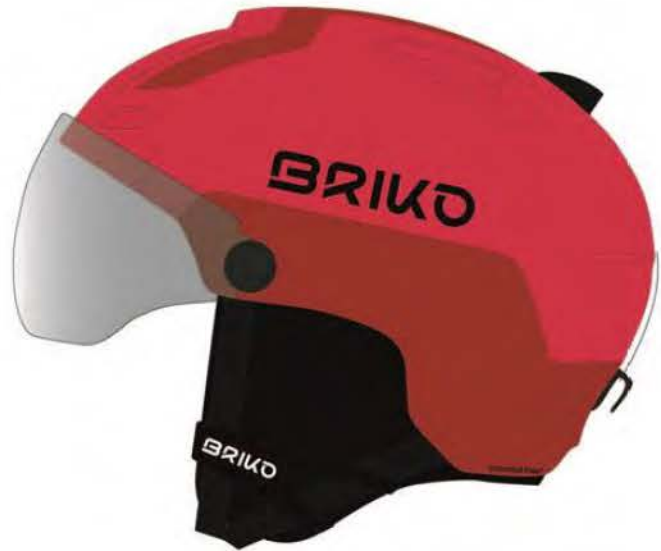
A06 MATT | RED ROUGE - SHINY RED DEEP

Stromboli Visor is the best match between lightness and UV rays protection thanks to a wide removable visor. The Venturi effect is empowered by two frontal holes for the best thermoregulation under the visor, avoiding this way the risk of fogging.