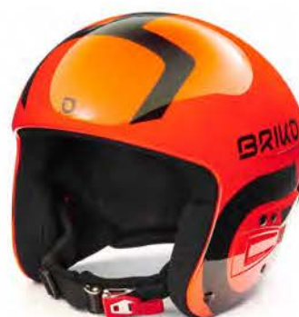
A0J SHINY ORANGE - BLACK