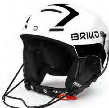
901 SHINY WHITE BLACK