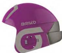
A0P SHINY VIOLET - SILVER