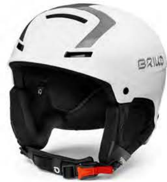
919 MATT WHITE