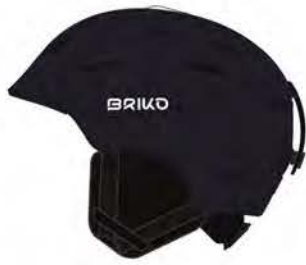
A0E MATT | BLUE SPACE