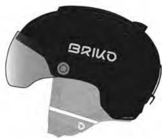
916 MAT | SHINY BLACK