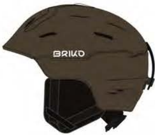
A0F MATT | DEEP BROWN