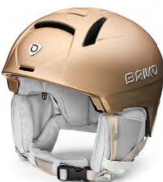
921 MATT CHAMPAGNE