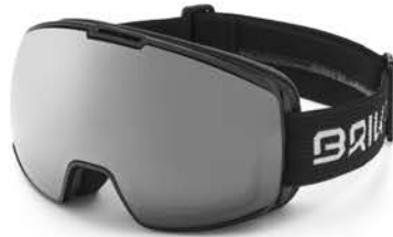
910 MATTI BLACK - SM2