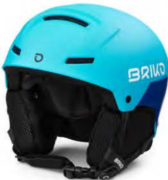
917 SHINY LIGHT BLUE BLU