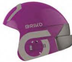
AOP SHINY VIOLET - SILVER

Briko guarantees the FIS 6.8 standard to the youngest racers too. Vulcano FIS 6.8 JR is a FIS 6.8 certificated helmet and it is Protetto System ready. Perfect fit thanks to the integrated roll-fit. Vulcano FIS 6.8 Jr won a 2015 ISPO Award in the Ski Helmets category thanks to its safety and technical innovations.