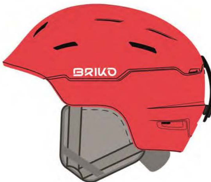
AU1/MAT | CHAUSSEU

Crystal X is characterised by 18 holes with a passive airflow system. Top safety and lightness results are reached thanks to the merging of the in-moulding technology of EPS and Polycarbonate with a ABS hard shell for the areas most exposed to high impact.