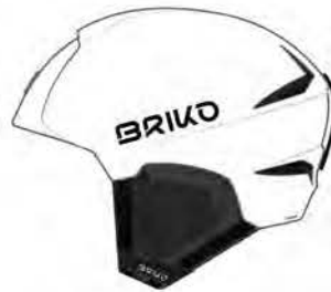
919 MATT WHITE