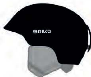
ADH -- MATT SHINY BLACK