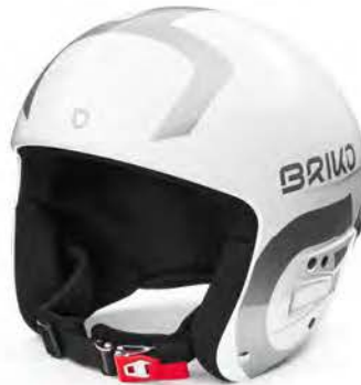
A0B SHINY WHITE - SILVER