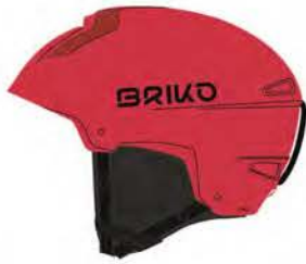
A00 MATT RED HOME - DEEP RED