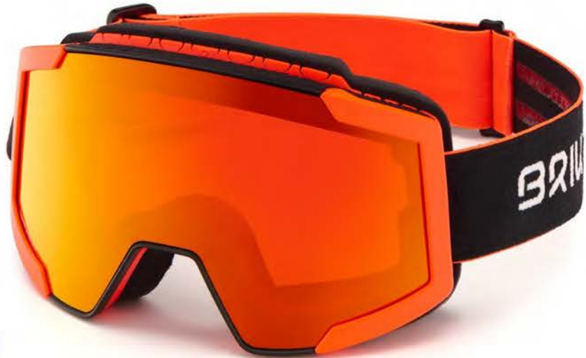
909 BLACK ORANGE F - HM3/PT

Lava FIS embodies the best of Briko research and technology. This goggle features a 7.6" extra wide frame to enhance visibility and maximize your field of view, a cylindrical blue light blocking double lens to provide unprecedented visual contrasts and reduce reaction time, our cutting-edge Bumper technology to protect you from frontal impacts and the Flexa system that makes the frame extremely soft and flexible to match everyone's unique features. In case of extreme weather conditions, a Racing Cap can be mounted to avoid eye lachrymation by reducing airflow inside the goggle. Lava 7.6" won an ISPO Award in the Ski Goggles category thanks to its design and technical innovations. The goggles include a Full Mirror Multi-Layer double lens with premium anti-fog and anti-scratch treatment and 100% UV protection.