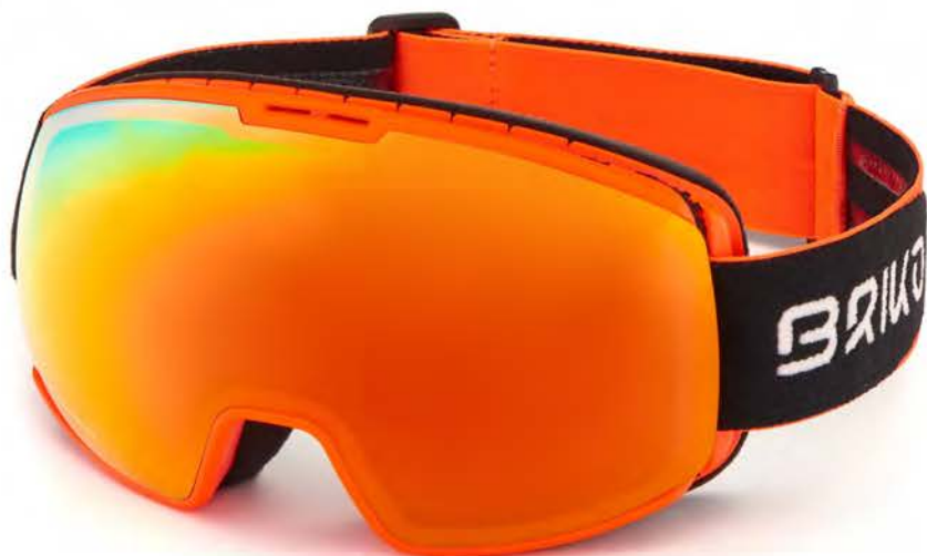
909 BLACK ORANGE F-BM3/P1