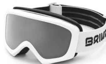
901 WHITE - SM2