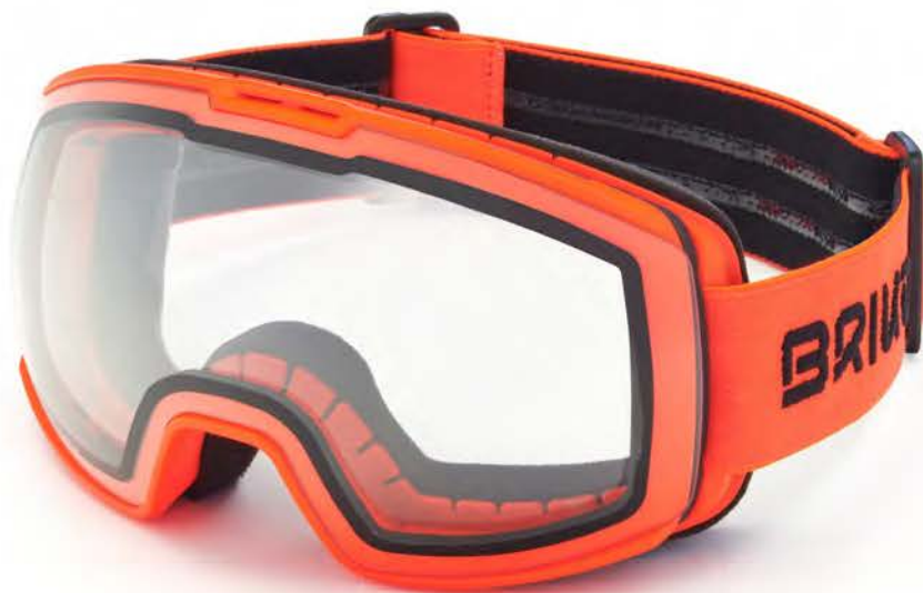
963 ORANGE FLUO-PHG13

The KILI 7.6 is specifically designed to offer maximum comfort and an exceptionally wide field of view on the snow. The goggles have a flexible extra-wide TPU frame and a 7.6" spherical double lens that enhances visibility and contrast for an improved visual experience. The goggles include a Full Mirror Multi-Layer double lens with anti-fog and anti-scratch treatment and 100% UV protection.