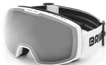
917 MATT WHITE - SM2