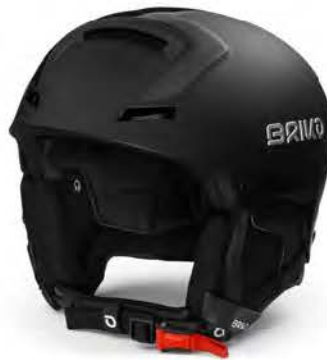
917 MATT BLACK