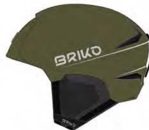
925 MATT DEEP GREEN