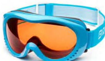
A05 -- LIGHT BLUE - DR2

Designed for the little ones, Koala is the perfect goggle for their first skiing or snowboarding experience. The spherical lens is made of superior quality durable materials to prevent the goggle from fogging up and block harmful UV rays. The soft TPU ergonomic frame adapts perfectly to smaller faces and delivers maximum comfort to the young racers.