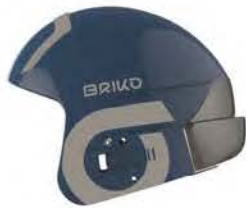
AOU SHINY BLUE - SILVER