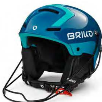
908 SHI BLUE LIGHT BLUE