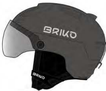
929 MATT SHINY GREY