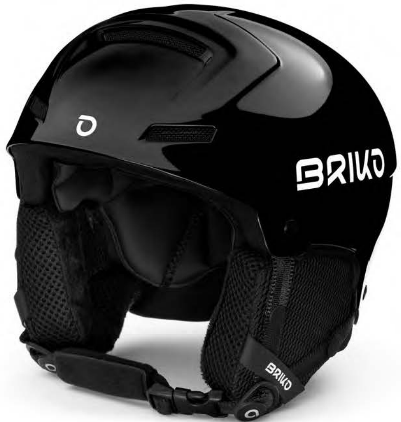
911 SHINY BLACK

Mammoth is composed by an outer ABS hard shell. Thermal comfort is guaranteed by internal tunnels linking the front holes to the rear ones. Mammoth's fit is the result of an adjustable 3d Roll fit that allows a three dimensional fit setting for the best helmet wearability.