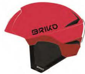
A00 MATT RED HOME - DEEP RED