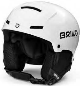
916 SHINY WHITE