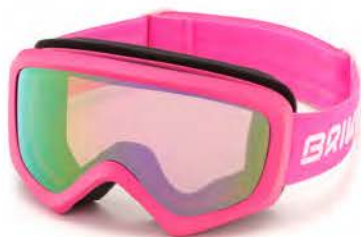
966 PINK - PM2