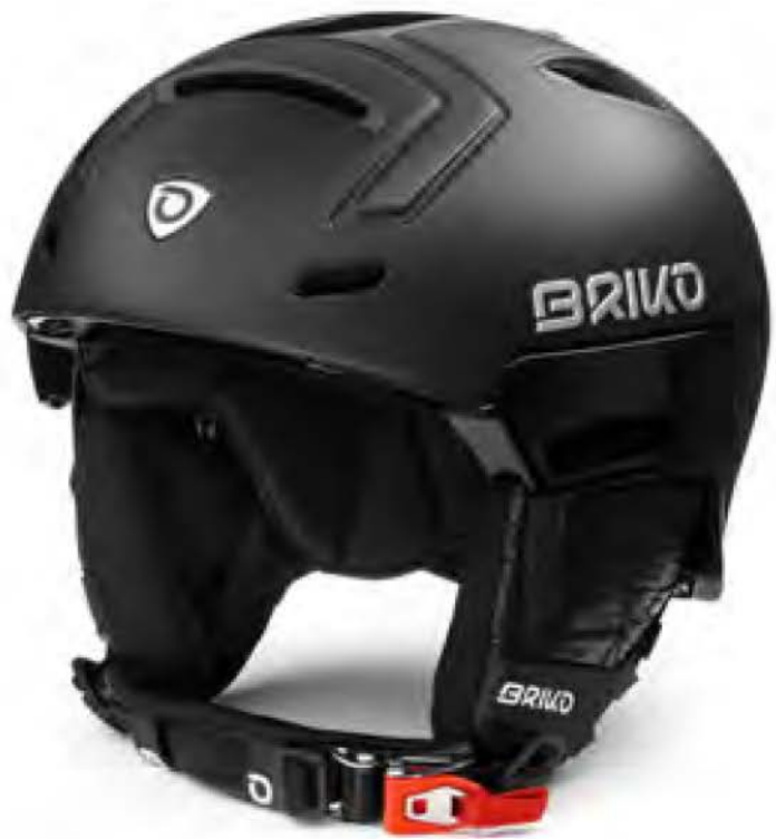
900 SHINY MATT | BLACK

Stromboli is a complete in mould helmet. Comfort and high quality finishes make of Stromboli a no-compromise helmet. The Venturi effect is empowered by two frontal holes for the best thermoregulation between helmet and goggles, avoiding this way the risk of fogging.