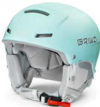
921 MATT SEABLUE