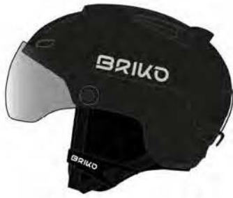
900 SHINY MATT | BLACK