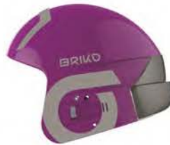
A0P SHINY VIOLET - SILVER