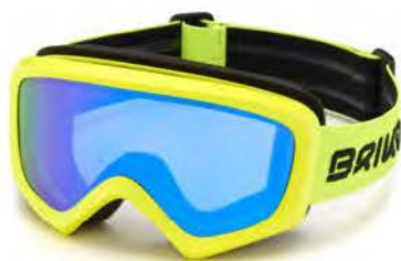
956 YELLOW FLUO - BM2