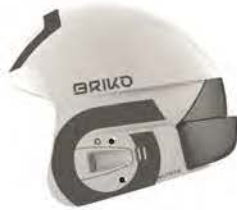
A08 SHINY WHITE - SILVER