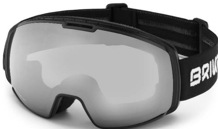
910 MATT BLACK - SM2

Thanks to its lateral claws system the NYIRA Free Fighter adapts perfectly to any type of helmet and matches everyone's unique features. The top-of-the-range spherical double lens provides a greater field of view for every light condition. The goggles include a Full Mirror Multi-Layer double lens with premium anti-fog and anti-scratch treatment and 100% UV protection.