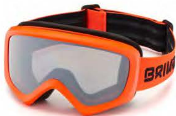
942 MATT ORANGE FL - SM2