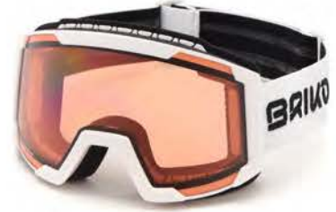
933 WHITE - P1