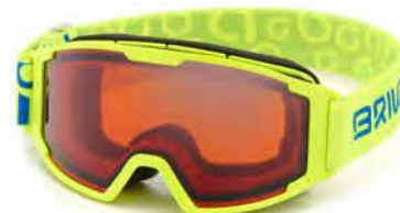
A20 YELLOW FLUO BLUE- BR2