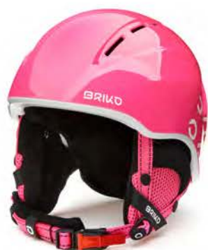
956 SHINY PINK WHITE