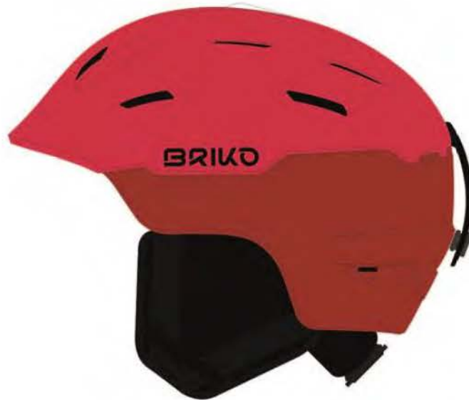
ADD MATT RED HOME - DEEP RED

Storm is characterised by 16 holes and by an active ventilation with 3 snaps in order to offer the maximum utilisation flexibility. The holes can be, in fact, completely shut, half-open or open, depending on the needs and on the weather conditions. Storm combines different construction materials, polycarbonate and ABS, to gain the top safety and lightness.