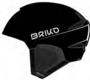
917 MATT BLACK