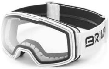
916 WHITE - PHG13