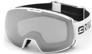
911 MATTI WHITE - SM3