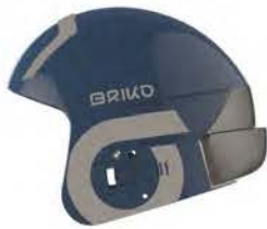
A0U SHINY BLUE - SILVER