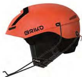
900 SHINY ORANGE - BLACK