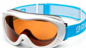
A02 -- WHITE - BR2