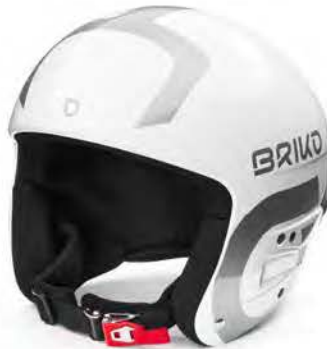
AOB SHINY WHITE - SILVER