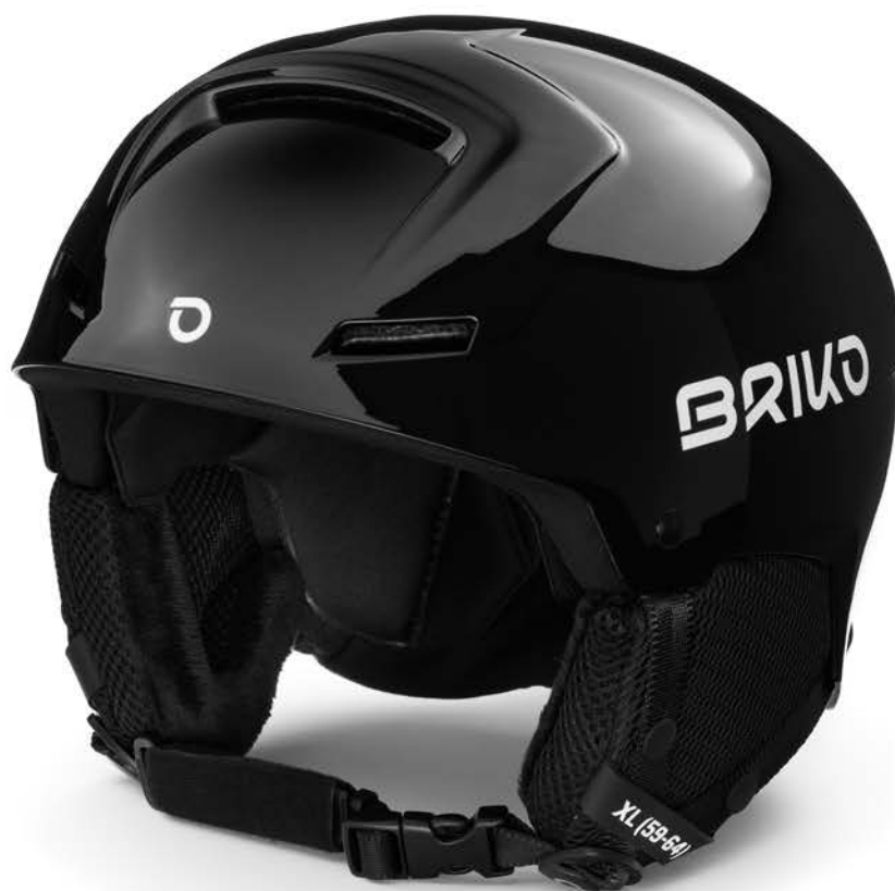
911 SHINY BLACK

A comfortable and safe helmet with a resistant outer ABS shell. Rental is the icon of practicality; helmet sizes are also well visible on the goggle strap holder and it is possible to easily adjust the fit thanks to a practical roll-fit.