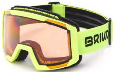
935 YELLOW FLUO - P1