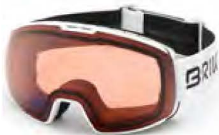
933 - MATT WHITE - P1