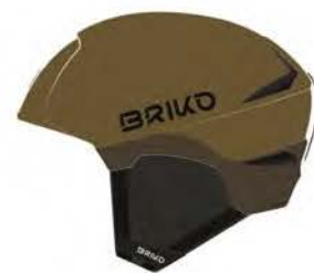
A02 MATT BROWN GREEN - DEEP BROWN

This is our lightest helmet. The best of the in moulding technology merges with the thermoformed inner padding to create a helmet you hardly feel on your head.