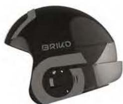
A0N SHINY BLACK - SILVER