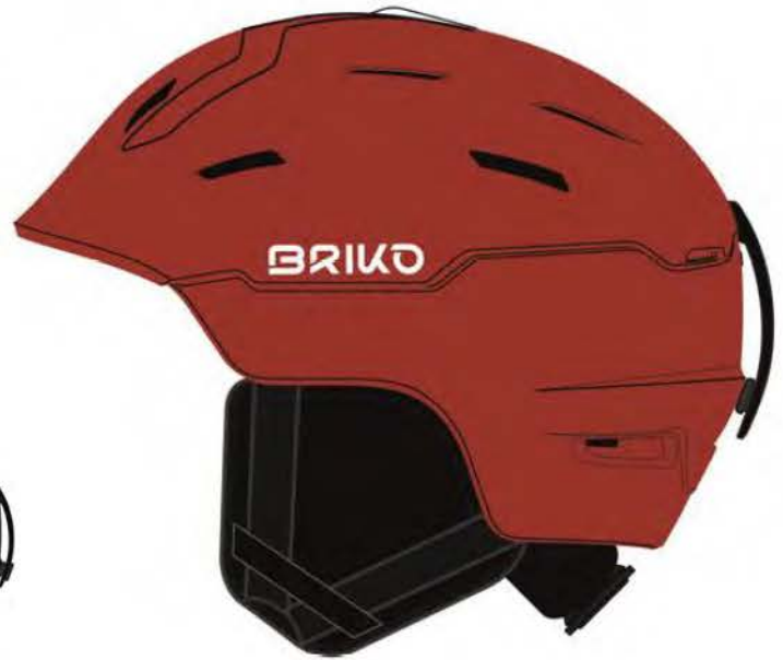
A0G MATT | DEEP RED

Storm X is characterised by 16 holes with a passive airflow system. Top safety and lightness results are reached thanks to the merging of the in-moulding technology of EPS and Polycarbonate with a ABS hard shell for the areas most exposed to high impact.