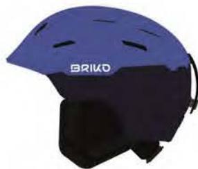
A01 MATT BLUE PLANET - BLUE SPACE