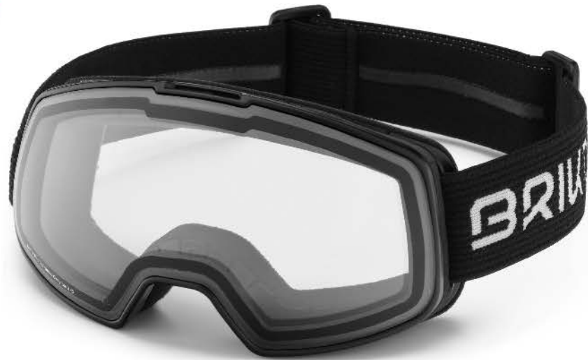
911 BLACK - PHG13