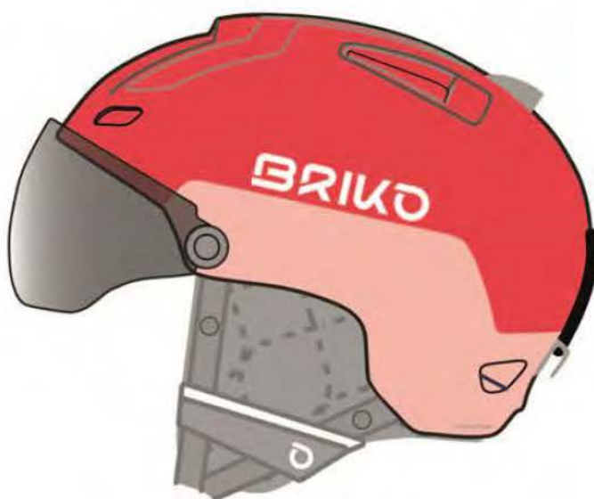
AOE MATT CHAUSRED - SHINY PINK SOFT

Ambra Visor is the best match between lightness and UV rays protection thanks to a wide removable visor. The Venturi effect is empowered by two frontal holes for the best thermoregulation under the visor, avoiding this way the risk of fogging.