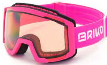
936 PINK - P1