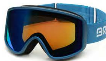
977 CAMEO BLUE - BM3