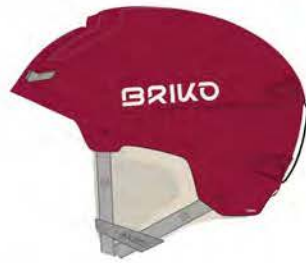
926 MATT RED RUBINE