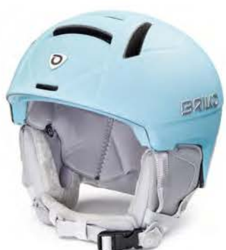
921 MATT SEA BLUE