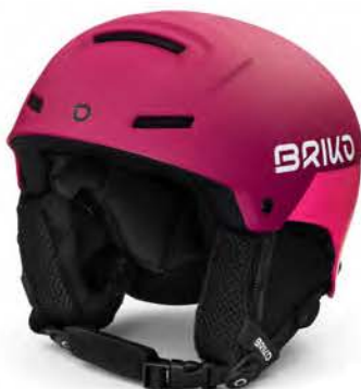
918 SHINY PINK VIOLET