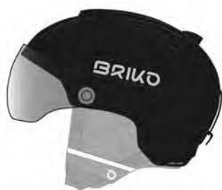
916 MATT SHINY BLACK