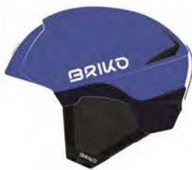
A01 MATT BLUE PLANE I - BLUE SPACE