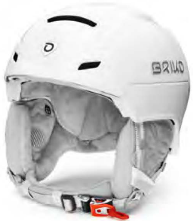
919 MATT SH PEARL WHITE

Ambra is a complete in mould helmet. Comfort and high quality finishes make of Ambra a no-compromise helmet. The Venturi effect is empowered by two frontal holes for the best thermoregulation between helmet and goggles, avoiding this way the risk of fogging.