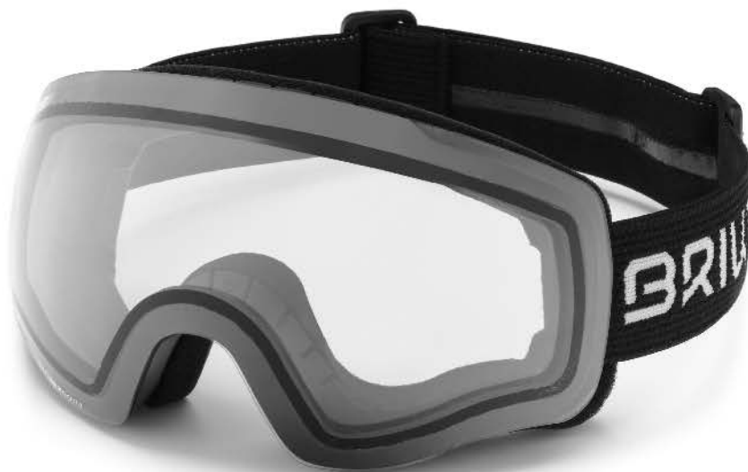
911 BLACK - PHG13

The Kaba features a frameless construction for an unobstructed view, minimal distortion which improves reaction times and a modern design. Its state-of-the-art double spherical lens enables superb performances ensuring an extra wide 8.9 inches field of vision. The Flexa technology and its large size fit make the Kaba a versatile goggle, able to accommodate different face shapes. The goggles include a Full Mirror Multi-Layer double lens with anti-fog and anti-scratch treatment and 100% UV protection.