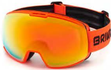
955 ORANGE FLUO - HM3