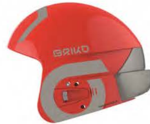
A0I SHINY RED SILVER

Vulcano FIS 6.8 is the world cup helmet FIS 6.8 certified. FIS 6.8 is the most restrictive safety certification. The Briko "PROTETTO" patented system is an additional ABS shell able to absorb shocks and increase safety. Its position increases shock absorption on the nape area that is the most frequently impacted in case of a fall. During 2014 Vulcano FIS 6.8 had been awarded with an ISPO Award in Ski Helmets category and it had been selected for the ADI INDEX annual publication, competing this way to Compasso d'Oro award selection.