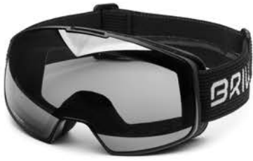
940 MATTI BLACK - SM2