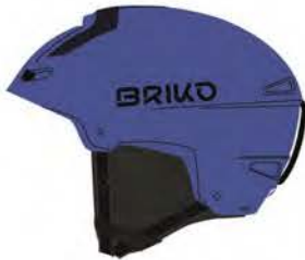
A01 MATT BLUE PLANE I - BLUE SPACE