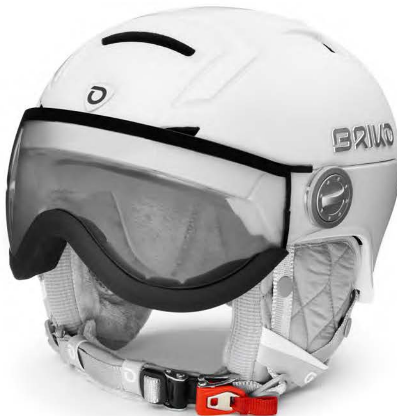
919 MAT | SHEARL WHITE

Ambra Visor is the best match between lightness and UV rays protection thanks to a wide removable visor. The Venturi effect is empowered by two frontal holes for the best thermoregulation under the visor, avoiding this way the risk of fogging.