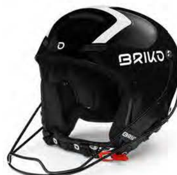
910 SHINY BLACK WHITE