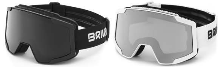
907 BLACK - SB3PT