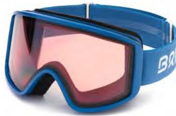
930 CAMÉLÉ BLUE - P1