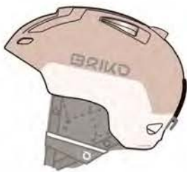
A00 MATT QUARIZ - SHINY WHITE ANTIQUE