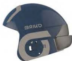
A0U SHINY BLUE - SILVER