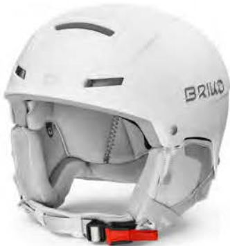
917 MATT PEARL WHITE