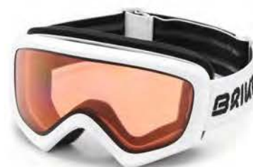
933 WHITE - P1