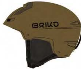
A02 MATT BROWN GREEN - DEEP BROWN

Faito is composed by an outer ABS hard shell and made precious by higher range technical details. Thermal comfort is guaranteed by internal tunnels linking the front adjustable holes to the rear passive ones. Faito's fit is the result of an adjustable 3D roll fit that allows a three dimensional fit setting for the best helmet wearability.