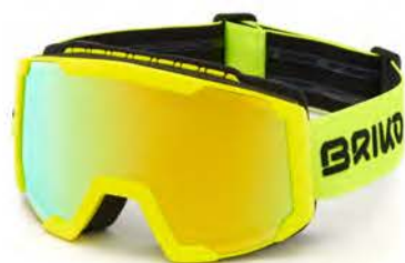
929 YELLOW FLUO - YM2