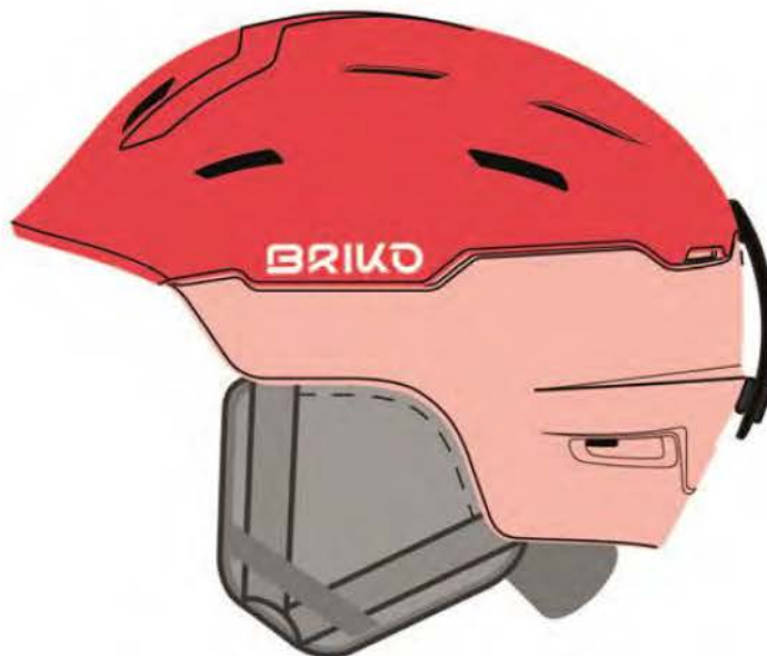
A09/MATT CHAUS RED - PINK SOFT

Crystal is characterised by 16 holes and by an active ventilation with 3 snaps in order to offer the maximum utilisation flexibility. The holes can be, in fact, completely shut, half-open or open, depending on the needs and on the weather conditions. Crystal combines different construction materials, polycarbonate and ABS, to gain the top safety and lightness.