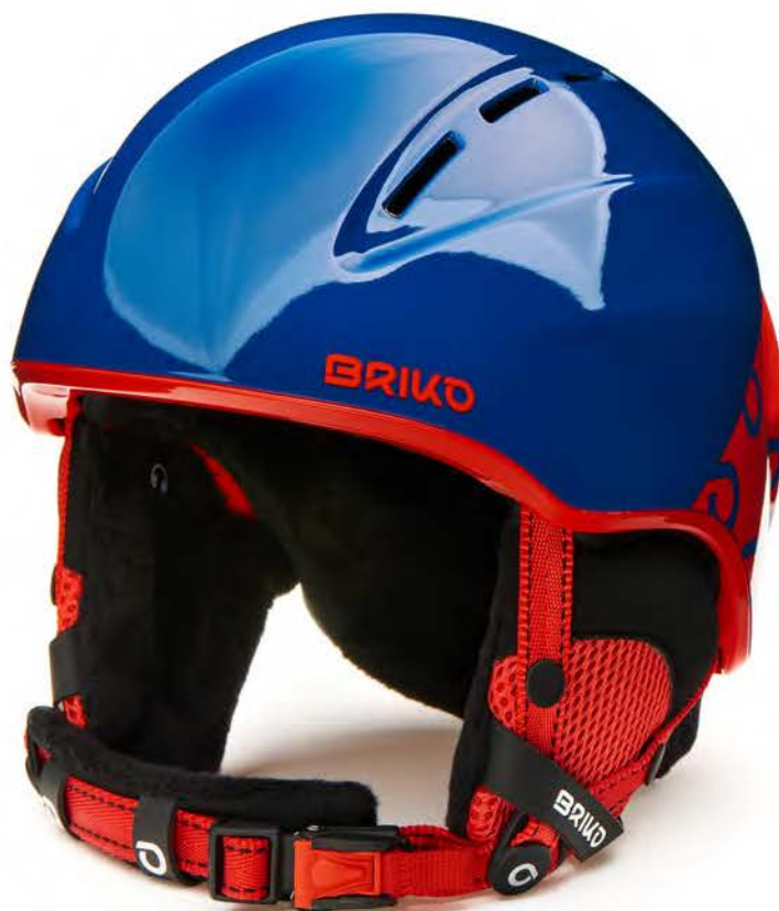
956 SHINY BLUE RED

In moulding helmet for the young athletes. Lightweight fit, comfort and with antibacterial treatment inner padding.