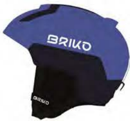
A01 MATT | BLUE PLANE I - BLUE SPACE