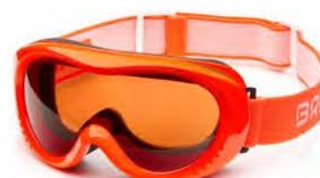
A03 -- ORANGE FLUO - DR2