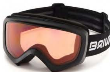
932 BLACK - P1