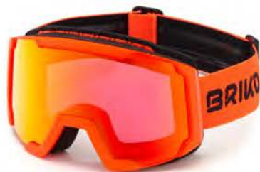
928 ORANGE FLUO - HM2