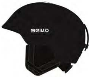
917 MATT BLACK