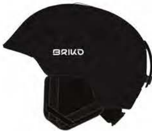
91/MAT | BLACK