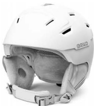
BT/MAT | PEARL WHITE