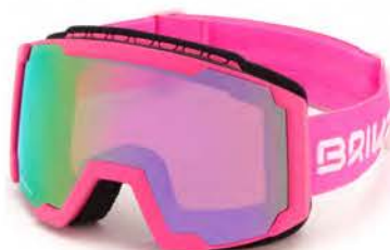
930 PINK - PUM3