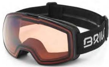
932 BLACK -P1