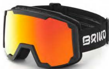
926 BLACK - HM3