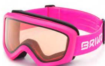
936 PINK - P1