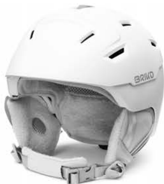
917/MATT PEARL WHITE