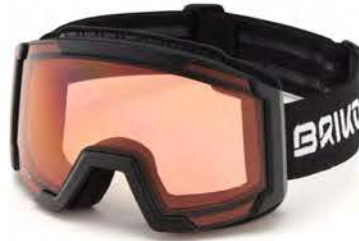
932 BLACK - P1