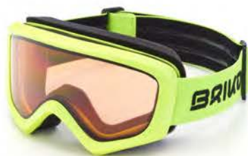
935 YELLOW FLUO - P1