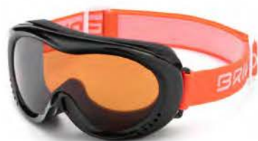
A01 -- BLACK - BR2