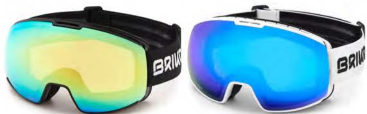
923 BLACK - YM2/P1