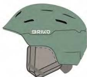
AU2/MAT | VERDIGRIS