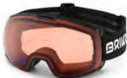
932 - MATT BLACK - PHG13