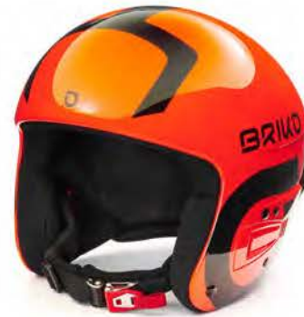
A0J SHINY ORANGE - BLACK