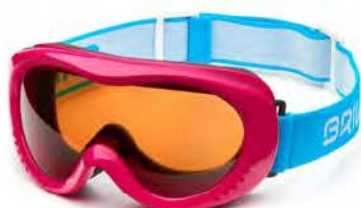
A04 -- PINK - BR2