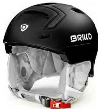
916 MATT SHINY BLACK