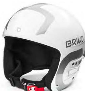
A0B SHINY WHITE - SILVER