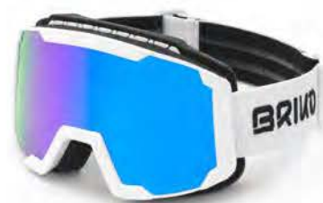
927 WHITE - BM3