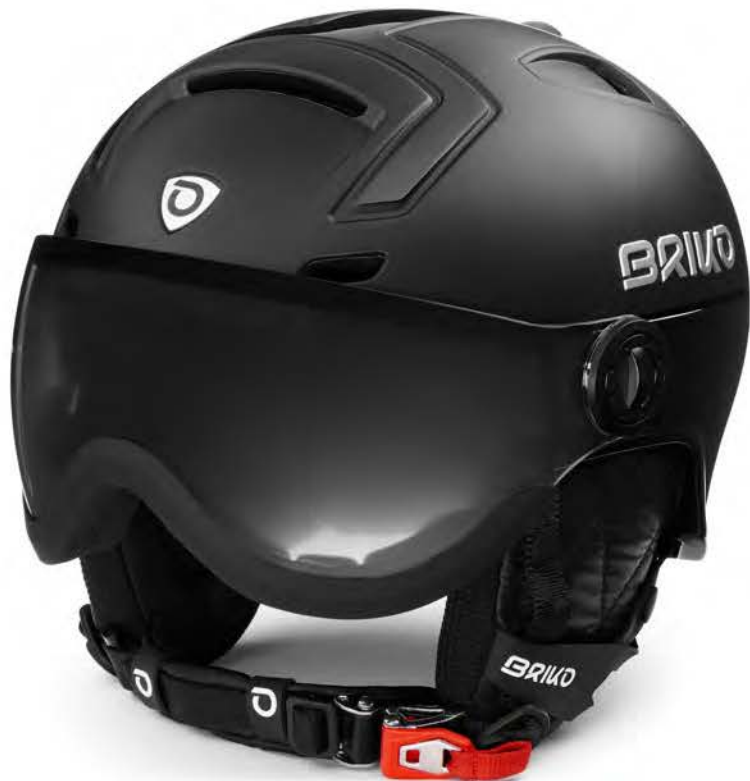
900 SHINY MATT BLACK

Stromboli Visor is the best match between lightness and UV rays protection thanks to a wide removable visor.