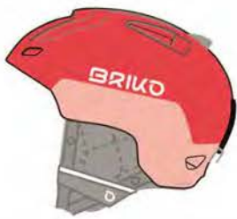
A09 MATT CHAUSSED - PINK SUFI