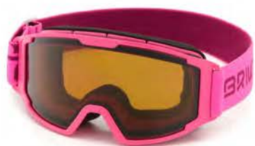
969 PINK PURPLE - BR2