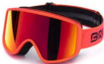
928 ORANGE FLUO - HM2