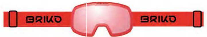
931 ORANGE FLUO -P1