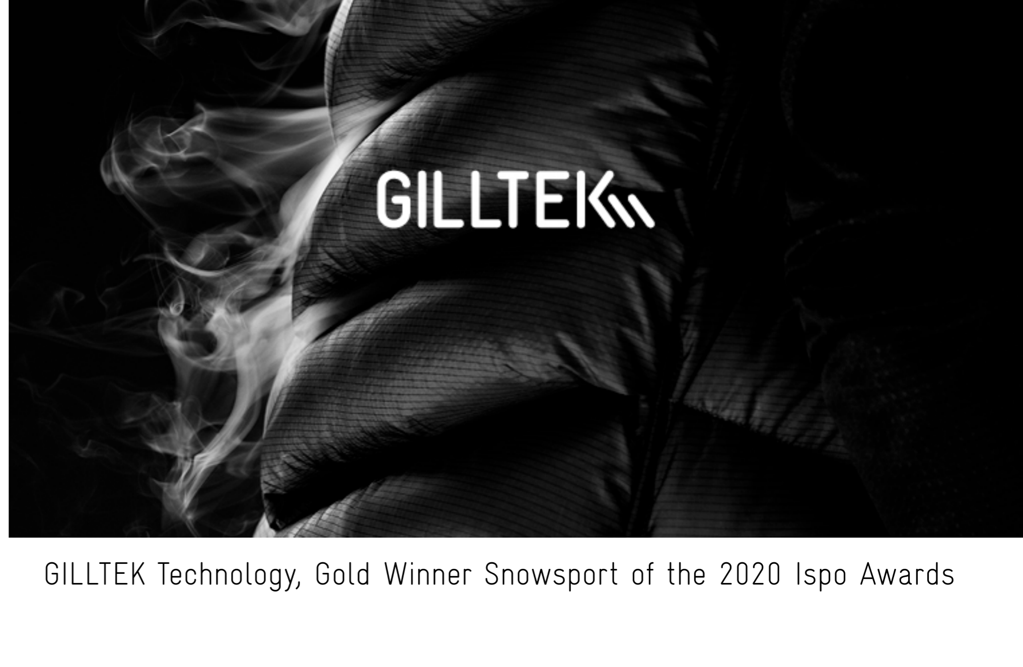
GILLTEK Technology, Gold Winner Snowsport of the 2020 Ispo Awards