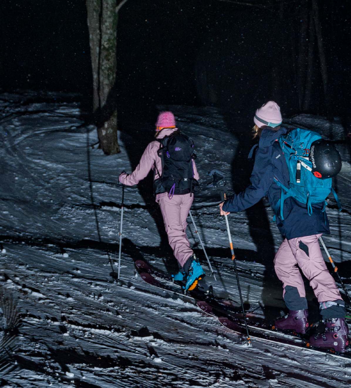
Orage Headlamp Night Skiing Event in Sutton, Qc.