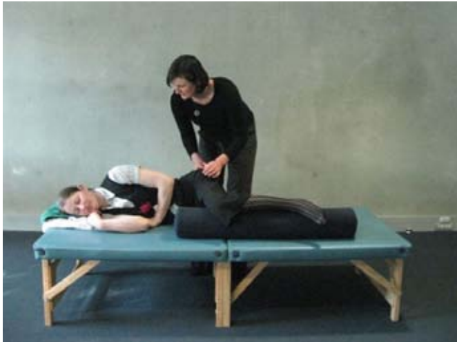
A Functional Integration lesson

The Feldenkrais Method is taught in two ways: Awareness Through Movement (ATM) lessons and Functional Integration (FI) lessons.