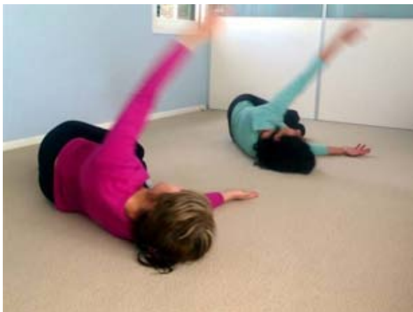
A Feldenkrais Awareness Through Movement lesson

At the cognitive level, you can learn principles of movement so that you are able to explore the movements on your own. During lessons you discover for yourself the quality