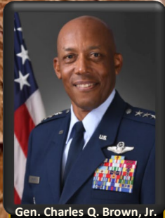
Gen. Charles Q. Brown, Jr. Chief of Staff of the U.S. Air Force