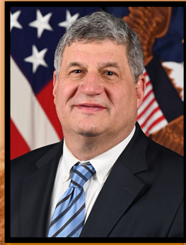
HON William A. LaPlante Under Secretary of Defense for Acquisition and Sustainment