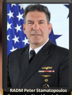
RADM Peter Stamatoopoulos Commander, Naval Supply Systems Command/Chief of Supply Corps

A full day of interactive briefings, focused on DoD's need to: (1) modernize the geriatric Nuclear-Triad; (2) modernize conventional forces for maximum lethality & survivability; and (3) continue to fuel "technology-surprise", (through Space; hypersonic-offense & hypersonic-defense; AI; 5G; directed energy; autonomy; long-range missiles; cyber; and counter-UAS). This year's Conference will occur shortly after formal-release of the President's FY2024 Budget Request, as OSD/Service Leadership, and COCOM Commanders, take the Congressional-stage. This event is structured for committed Defense Investors, Sr. Industry Management, DoD Officials, and Congressional Staff. There is no charge to attend, but you must pre-register for the event.