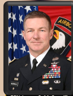
GEN James C. McConville Chief of Staff, U.S. Army