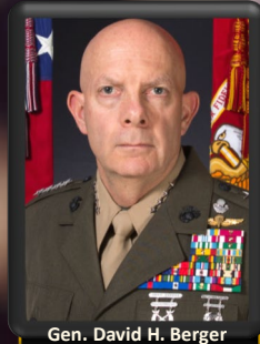
Gen. David H. Berger Commandant of the U.S. Marine Corps