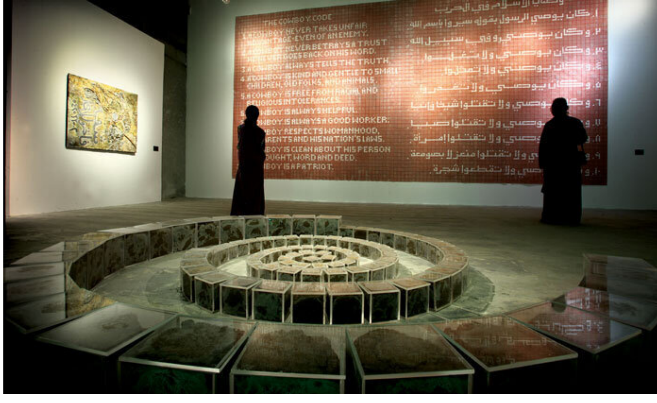
EDGE OF ARABIA JEDDAH: WE NEED TO TALK January 20 2012 - February 26 2012 AL FURUSIYA MARINA, CORNICHE ROAD, JEDDAH, SAUDI ARABIA

EDGE OF ARABIA JEDDAH: We Need to Talk Following its recent success with the first Pan--Arab exhibition of contemporary art 'The Future of a Promise' at the 54th Venice Biennale, on 19th January 2012 the internationally renowned arts initiative Edge of Arabia, with support from Abdul Latif Jameel Community Initiatives and Abraaj Capital, launched the most significant show of Saudi contemporary art ever held in the Kingdom of Saudi Arabia. Edge of Arabia Jeddah: We Need to Talk, curated by Mohammed Hafiz and co--curated by Edge of Arabia founder Stephen Stapleton, opened in a stunning 1000 square meter space in the Al Furusia Marina, a magnificent new development on the Jeddah Corniche overlooking the Red Sea.