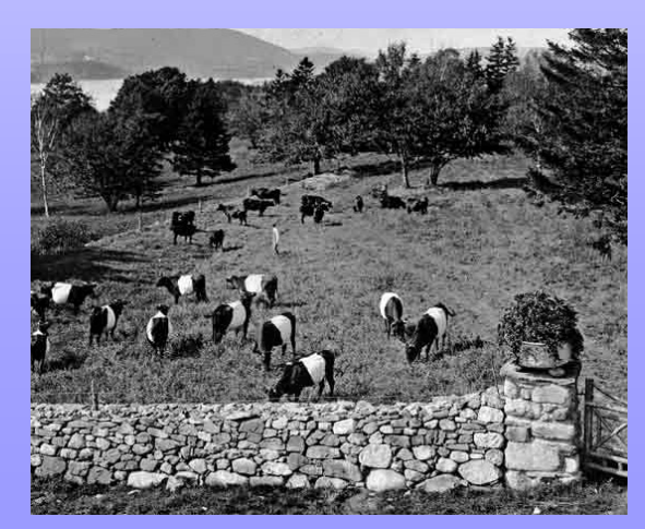
Lakenfeld cattle grazing, c. 1910

The first importation into the United States was in 1838. In 1840, P.T. Barnum imported several head from a nobleman. It is said they were secured with the understanding that they were to be used principally for exhibition as a feature of his great circus. The herdbook of the Dutch Belted Cattle Association of America was established in 1886. This is the oldest continuously registering herdbook for belted cattle in the world.