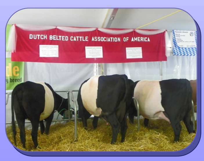
The DBCAA exhibit at World Dairy Expo in Madison, WI

Because of the critically low numbers of registered Dutch Belted females, a "breeding up" program has been developed. This program is based on using registered Dutch Belted sires on other dairy breed females. This provides a low cost entry for new breeders by expanding the numbers of registered cattle.