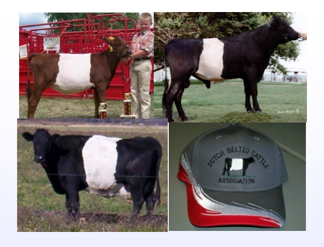
Dutch Belted Cattle Association of America