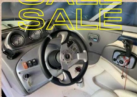
1986 WELLCRAFT ST. TROPEZ - $14,900