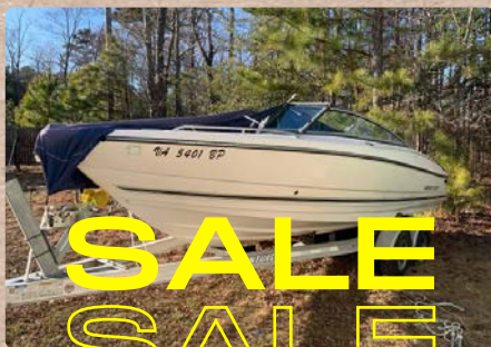
2009 MONTEREY BOWRIDER - $7,900

The majority of the museum's operating budget comes from the sale of donated boats and other items. This year we have expanded our program to include cars! Our inventory is low. Please consider the museum when deciding how to dispose of a boat or vehicle that you no longer need. We can pick up the vessel or car and provide the necessary paperwork for tax purposes. Your contributions greatly help the local community and our beloved museum. Please email us at donations@rfmuseum.org for more information on how to donate or to inquire about our current inventory!