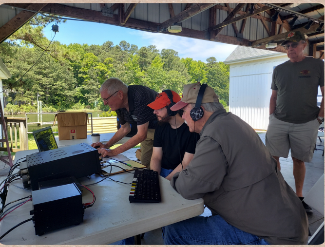
On behalf of the Rappahannock Amateur Radio Association, I would like to thank you very much for providing us with the opportunity to participate in the annual Museum Ships Weekend Event from the Reedville Fishermen's Museum this year.

We made approximately 170 radio contacts around the US including talking with 7 other Museum ships. This count is down a bit from some of our previous years but, as you have heard in the news recently, the unusually high solar activity lately "may cause shortwave radio blackouts at times". Well, it did! While we did notice some degradation in our "normal" radio conditions we were still able to make contact with stations from coast-to-coast. up into Canada, and south as far as the aircraft carrier USS Lexington down in Corpus Christi, Texas.