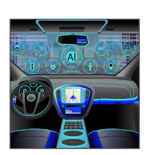
Car IoT Infotainment