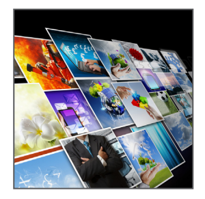
LED (OLED) displays