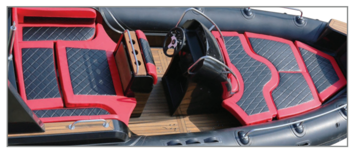
***Luxury Two-Tone Cushion with Diamond Stitch