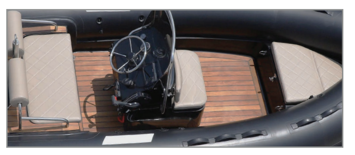
**Luxury One-Tone Cushion with Diamond Stitch