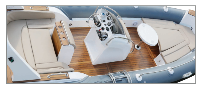
*Luxury One-Tone Cushion