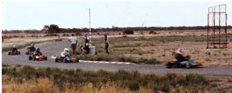
Racing at the club in the early 1980's (the straight is now the hairpin cut-through)

In 2009 the club installed lighting to the track, pit area and the grid to become one of the few tracks throughout Victoria that has the capability to race at night. The experience of racing under lights is what attracts the majority of competitors to the facility particularly for the clubs signature event, the North West Titles.