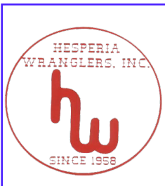
Cathleen Colby- 1959