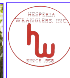
Beth Edmunds- 1999