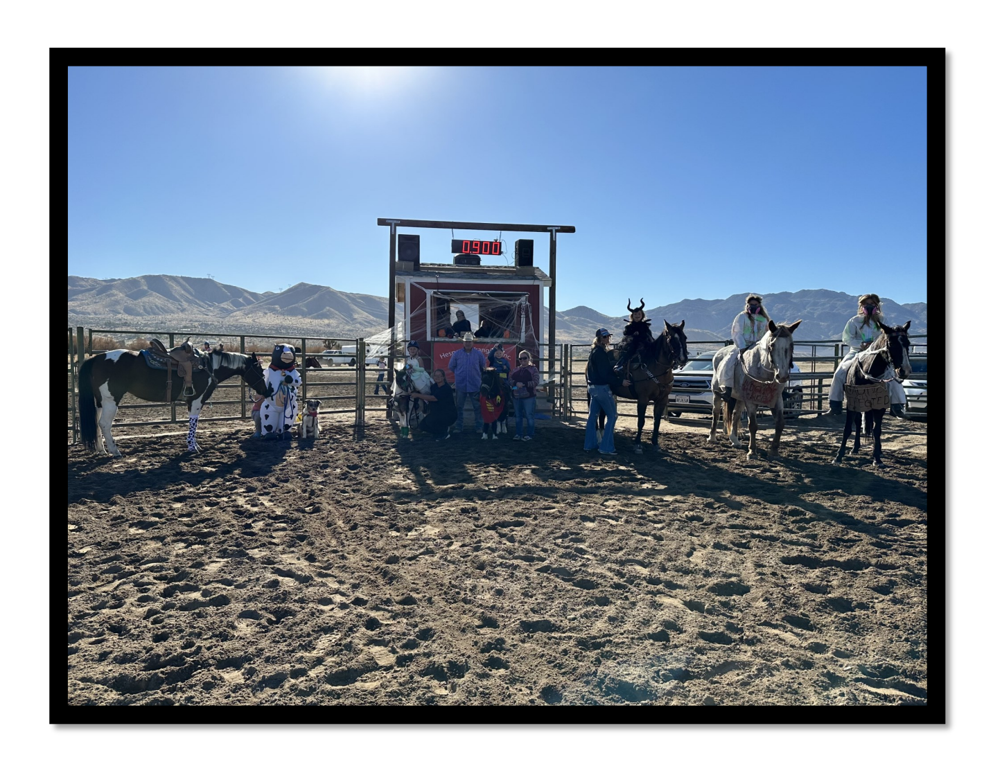
November 2023 Newsletter