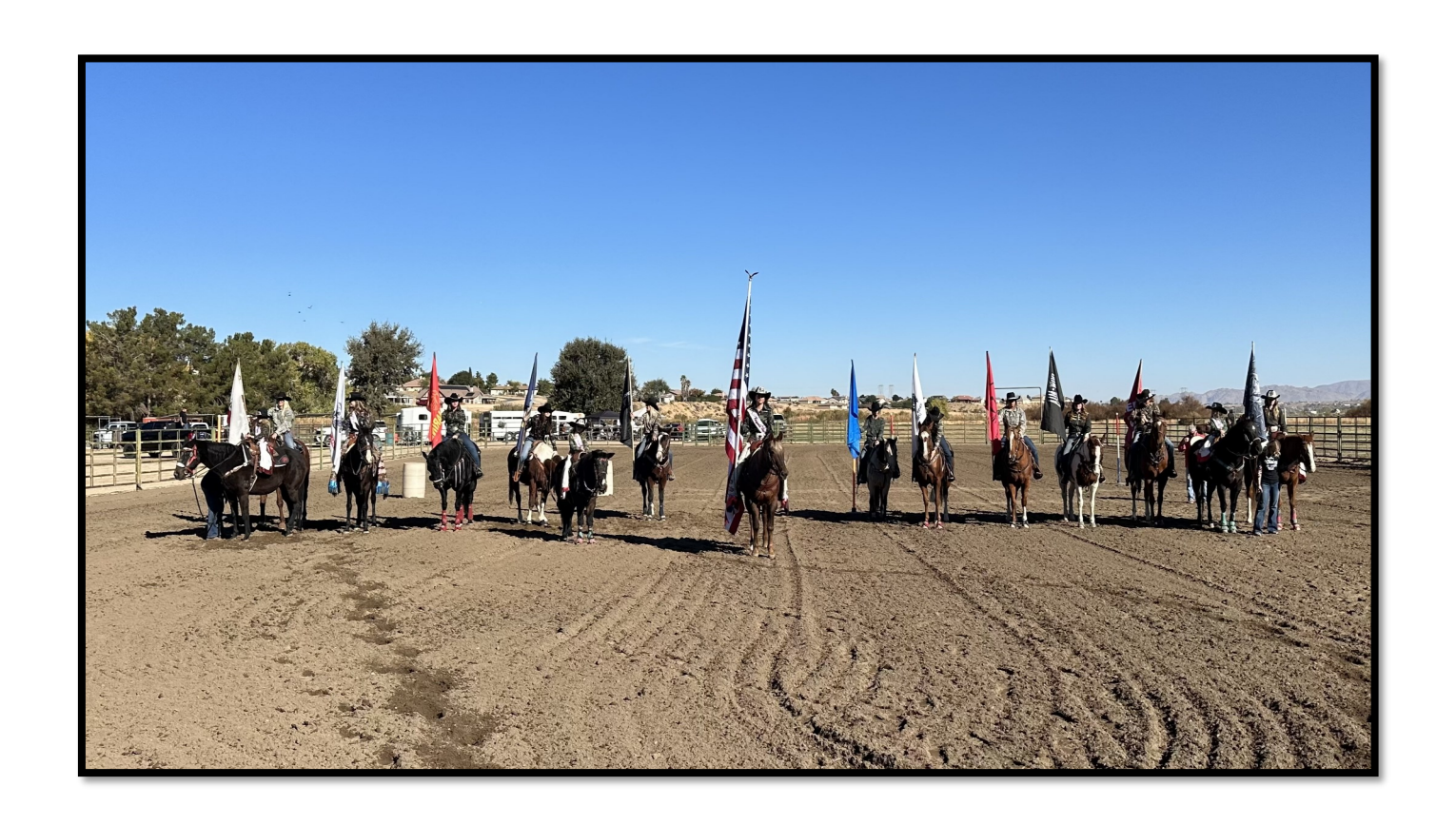
December 2023 Newsletter