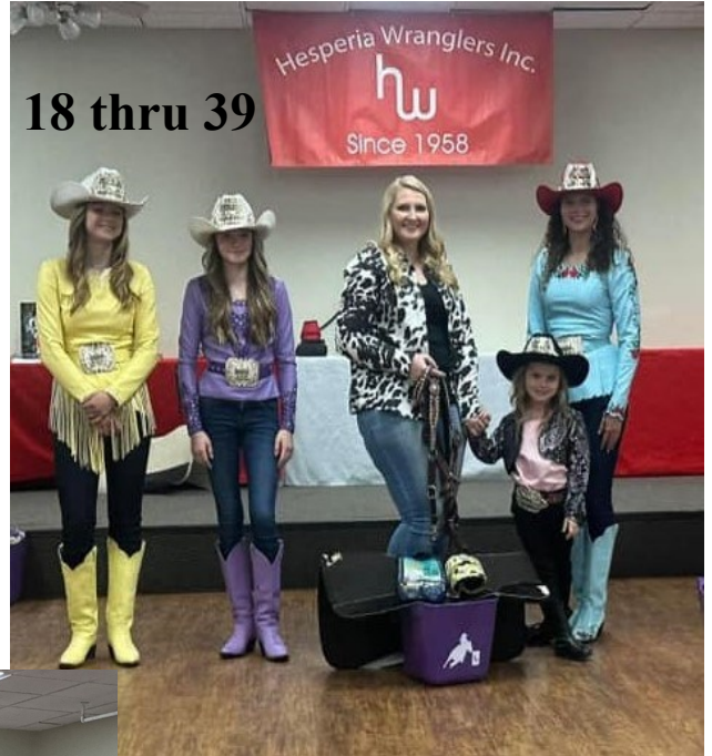
18 thru 39