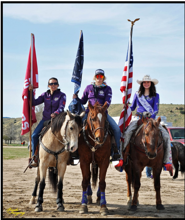
Opening ceremonies at the first show of 2024

Until next time... may your boots be dirty, your hair messy and your eyes sparkling.