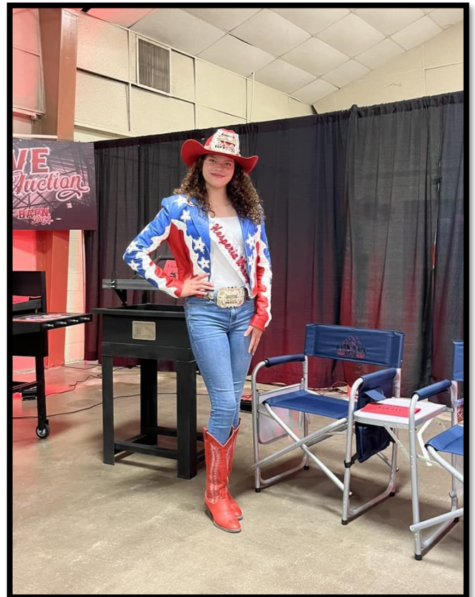
Barn Bash 2024, the evening after our first show.