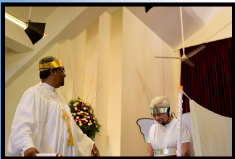
Senior Citizens presenting a Skit with Angel Gabriel and St. Peter, having the keys of heaven.