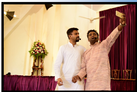
Young Adults Fellowship performing a skit on Social Media