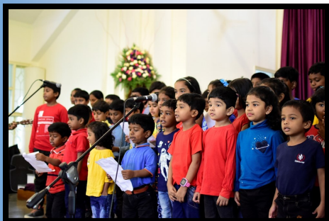
Sunday School Children singing a special song