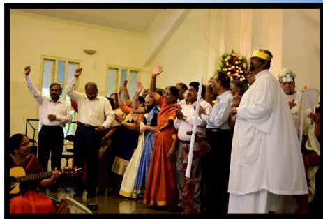
Senior Citizens presenting a song after the skit