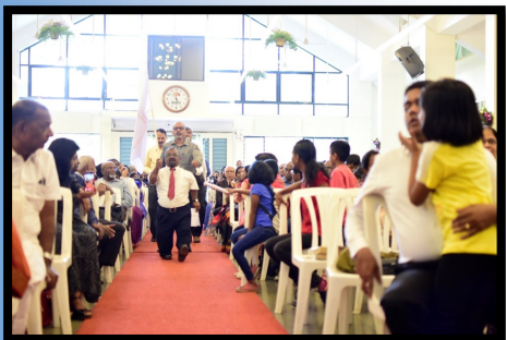
Methodist Men's Fellowship, marching towards the altar with the Christian Flag, singing the traditional Battle Hymn, "Onward Christian Soldiers"