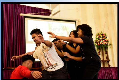
Methodist Youth Fellowship presenting a Mime on Christ's Saving Power