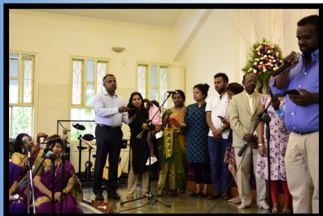
Sarjapur Road Methodist Church presented a documentary and a group song