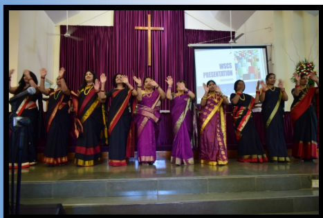
Women of the WSCS performing a dance on some regional numbers