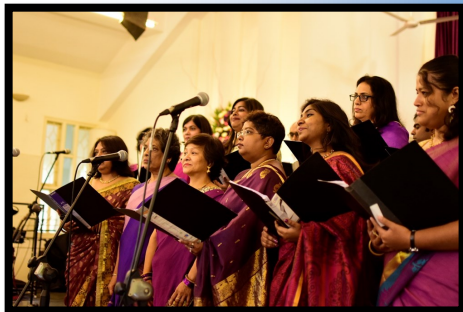
KMC Choir rendering a special number