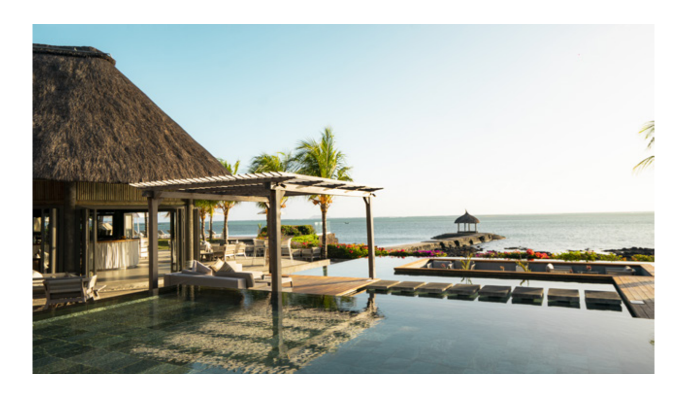
Veranda Paul et Virginie

An intimate and romantic boutique-hotel with emblematic views over the northern islands.