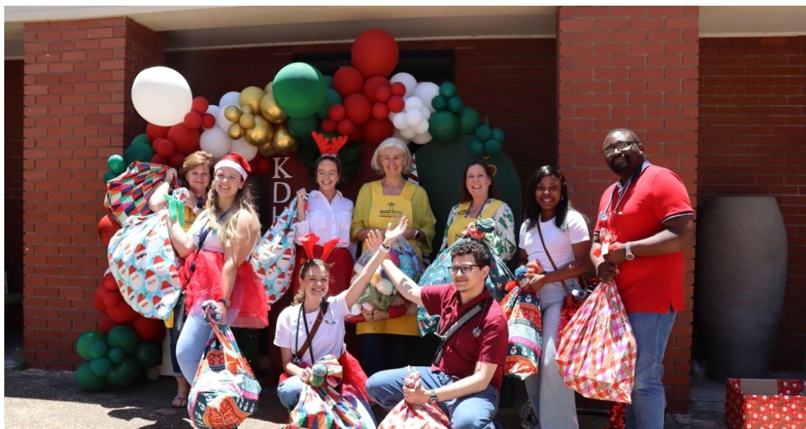
Staff at the Khayelitsha Day Hospital with items for the children's ward Christmas party. Cape Town diocesan provided more than 100 knitted teddy bears for the occasion.