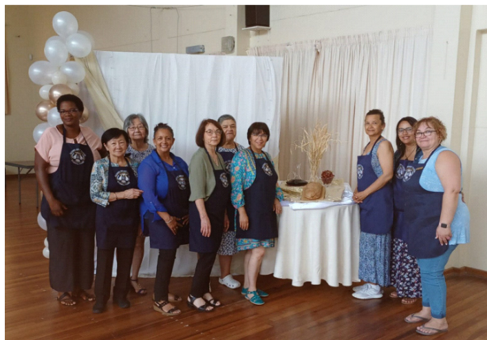
CWL Sacred Heart, Gqeberha.