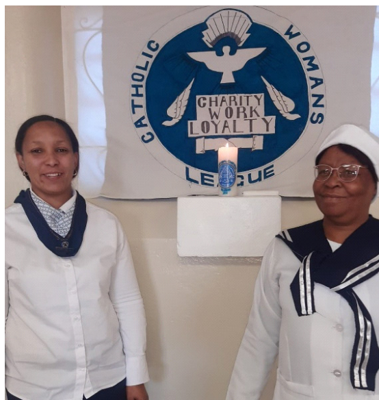
Ladies from the De Aar diocese at their AGM