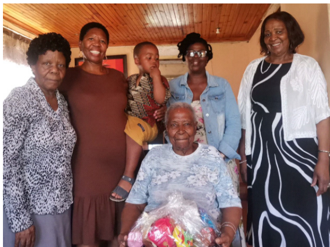
CWL from the Church of the Resurrection, Gqeberha, visiting an honorary member.