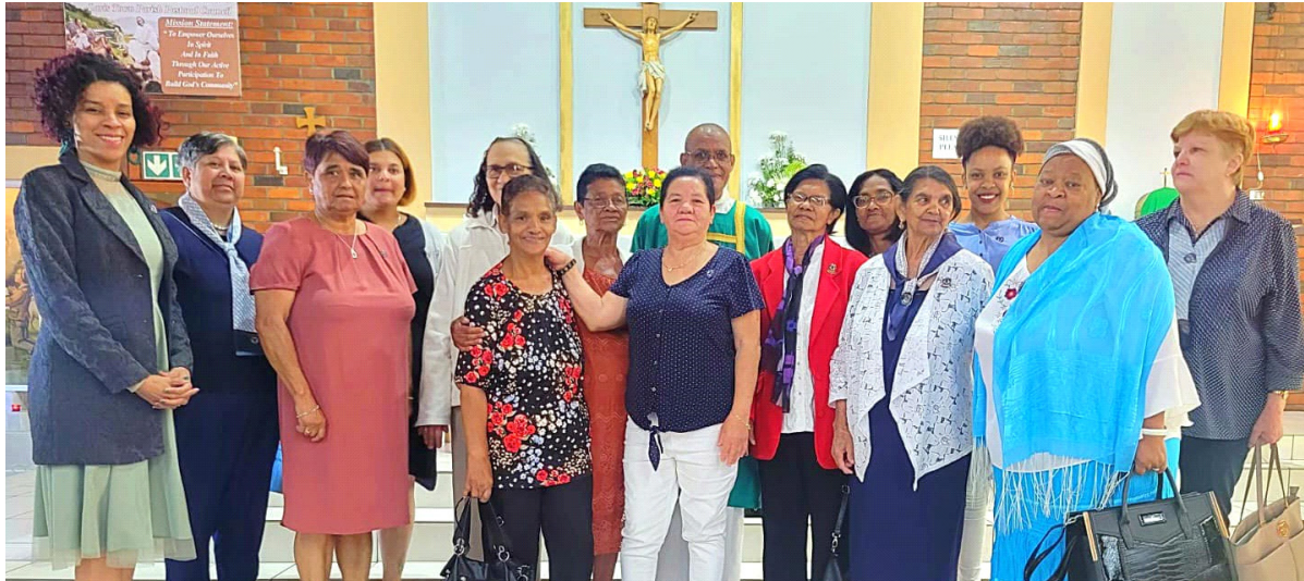
Bishop Lavis in Cape Town enrolled 7 new members and 5 old members renewed their commitment.