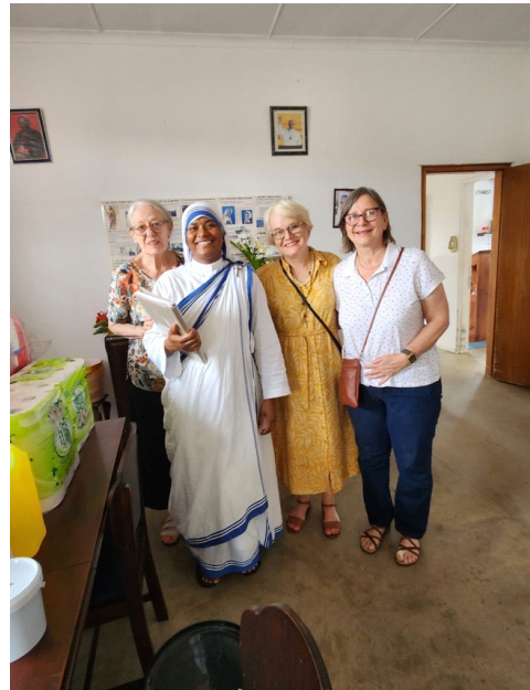
Vrouebond lede van St Konrad, Dysselsdorp.