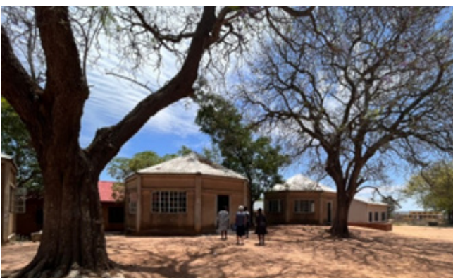
Heading to one of the classrooms at Motse Maria being renovated by the CWL.