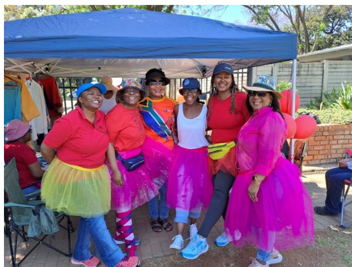
CWL members from Sacred Heart Cathedral, Pretoria, at the diocesan morning market.