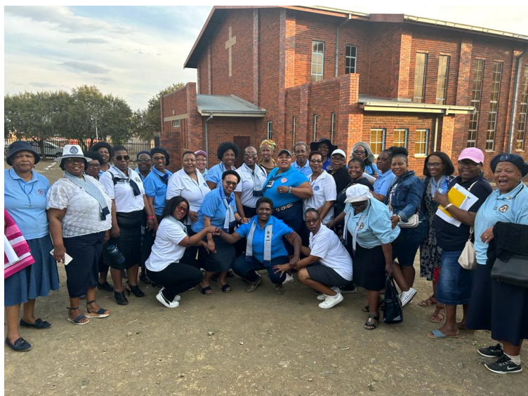
CWL members attending the Bloemfontein archdiocesan AGM.