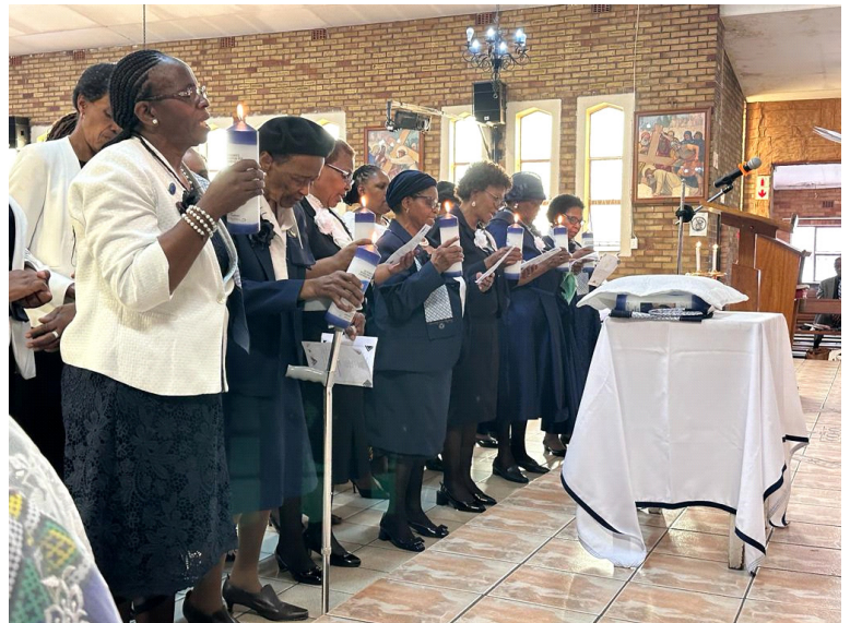
Members of St Margaret CWL, Diepkloof, celebrating the 30th anniversary of their branch.