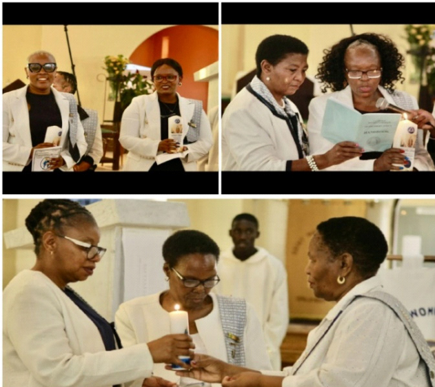
St Martin CWL, Orlando West, enrolling new members.