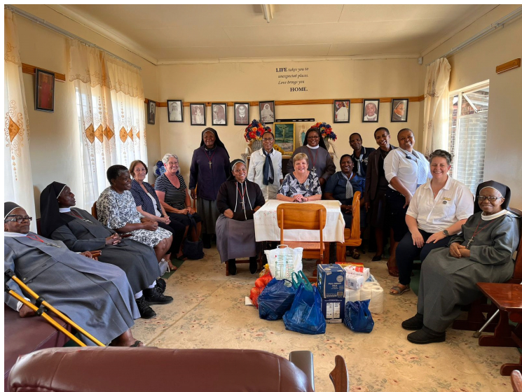
Polokwane CWL and the National Committee visiting the sisters at St Scholastica's Convent, Sekutu.