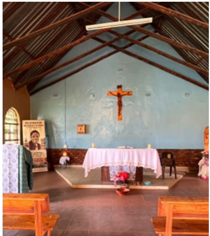
The interior of the church at Nweli.