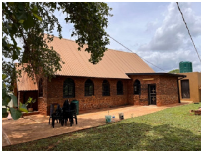
The church at Nweli where Bl Benedict Daswa is interred.