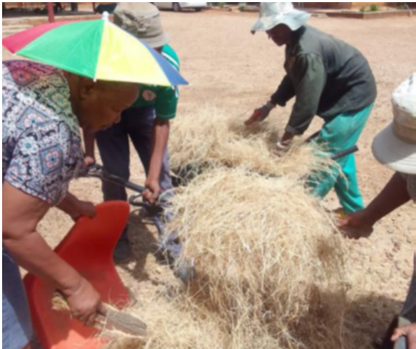
Members of St Mary's, Mahikeng deanery, cleaning up near their priest's residence.