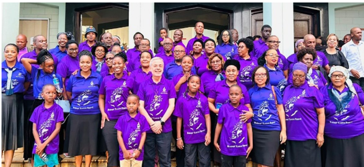
At Our Lady of Assumption with Bishop Ponce de Leon, wearing our seminarians' Lenten shirts.