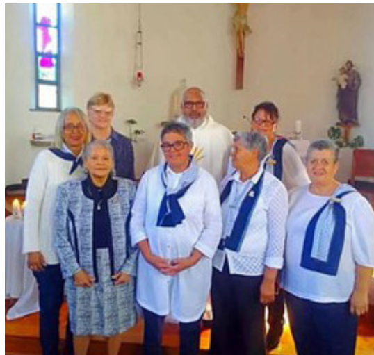
Members of Retreat, Cape Town, who received their long service badges.