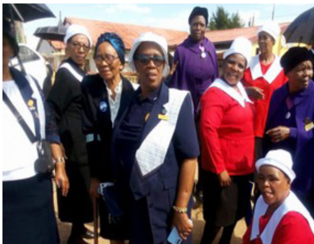
CWL St Paul's, Jouberton, joining an anti-gangsterism march.