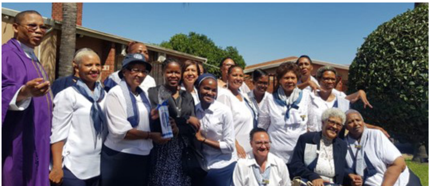
St Joseph's CWL at Eersterust, Pretoria, celebrated their 37th anniversary.