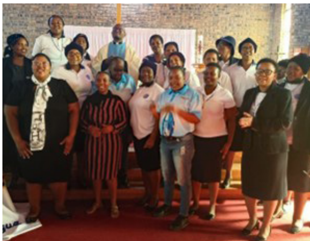
Members of Regina Pacis, Polokwane, at their Day of Recollection.