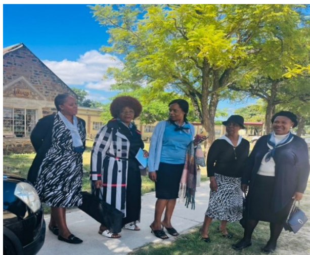
Members of St Joseph's CWL visiting an outstation.