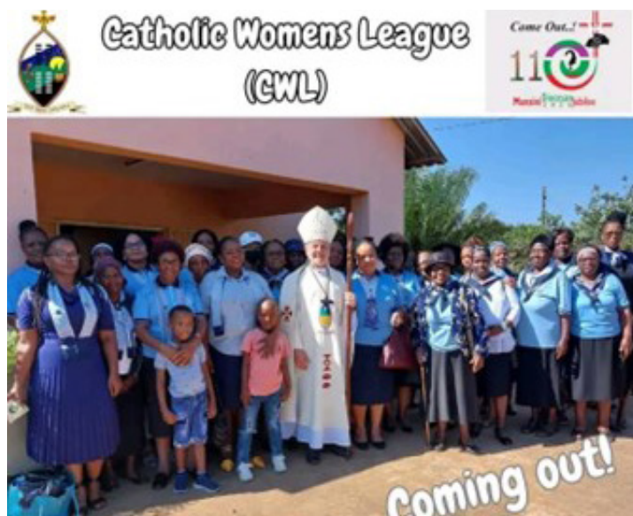
Visit to the parish of St Peter and St Paul.