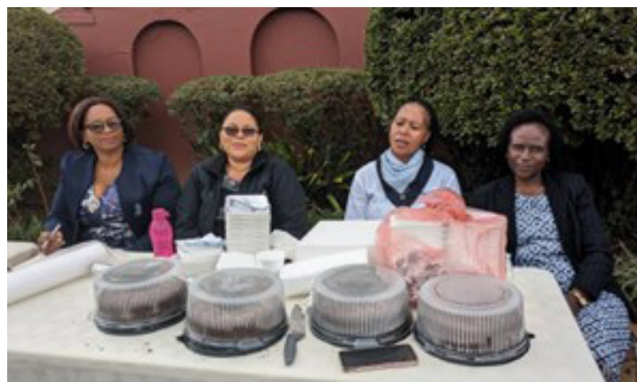
CWL Mater Dolorosa's Mother's Day cake sale.