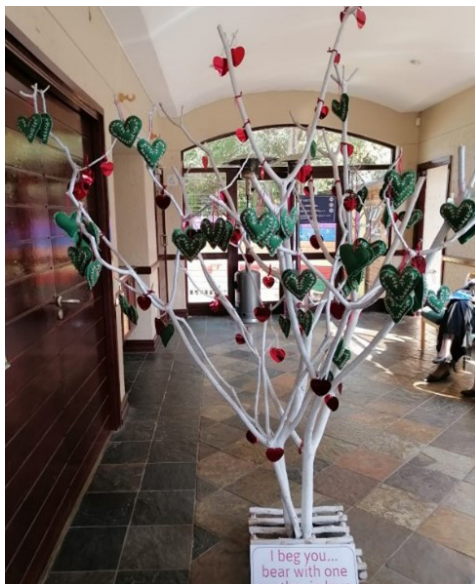
The Jesse tree at the WWDP hosted by Trinity Methodist church, Linden.