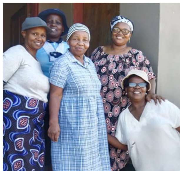
Sacred Heart CWL visiting their elderly members.