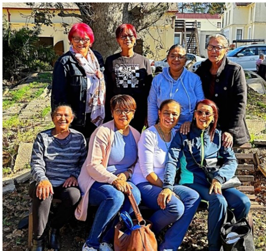
Cape Town ladies at Schoenstatt.