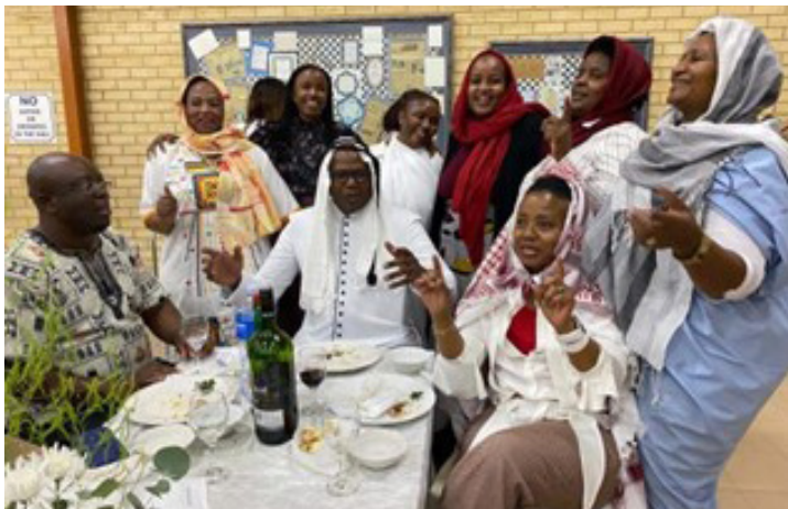
Sacred Heart Cathedral, Pretoria at their Paschal meal.