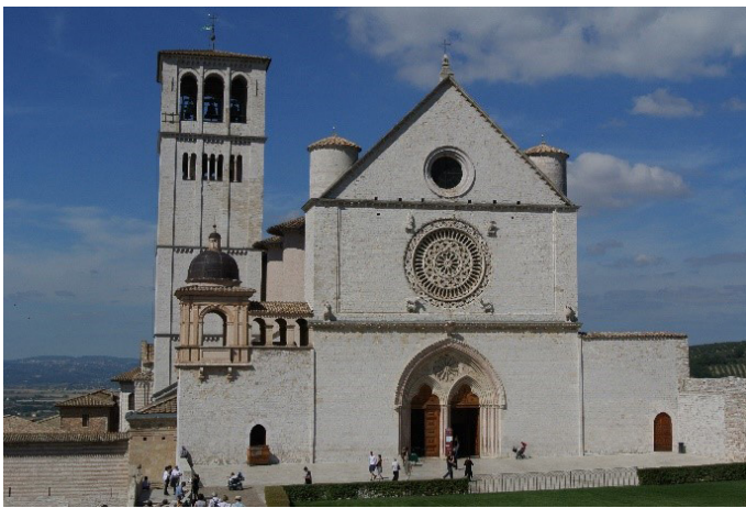
Basilica of St Francis, Assisi