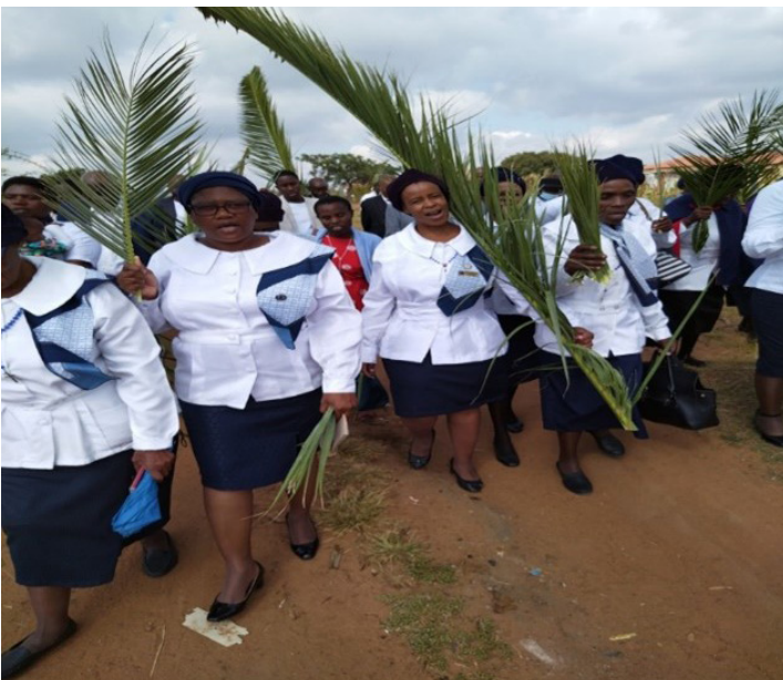
CWL at St. Francis of Assisi, Polokwane, celebrating Palm Sunday