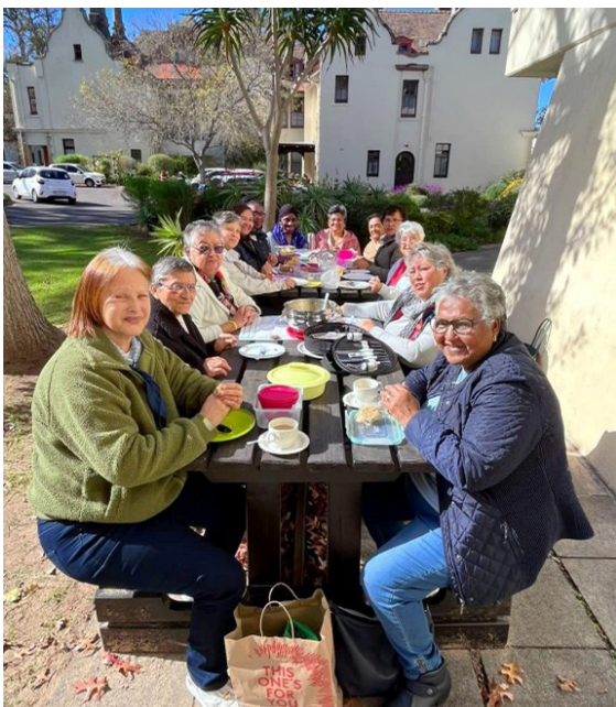
Cape Town ladies enjoying lunch at their Day of Reflection.