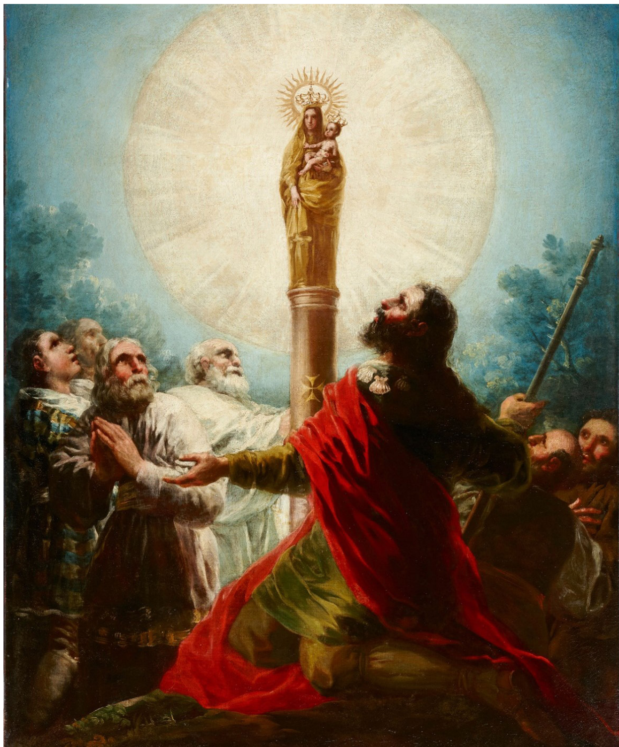
The apostle St. James and his disciples adoring the Virgin of the Pillar