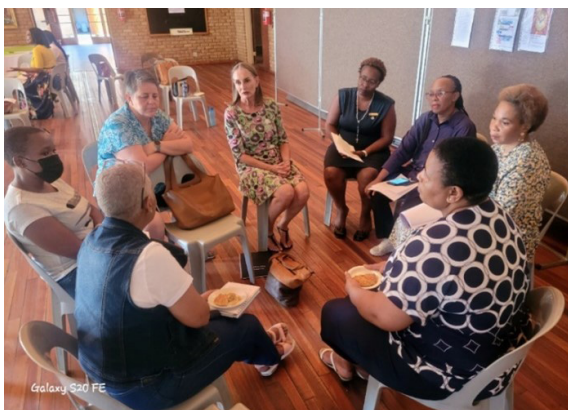
Treasurers' breakaway forum

Members attending the workshop formed breakaway groups to address specific needs and expectations, and shared best practice strategies for their specific leadership portfolios.