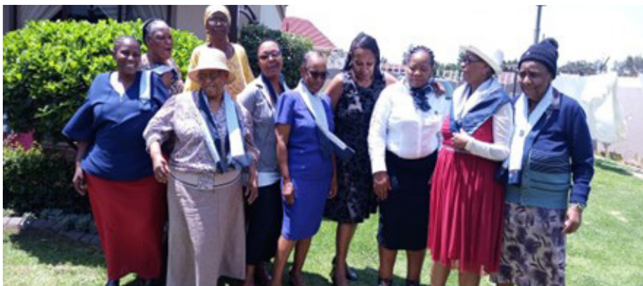
East Rand Executive

Mt Carmel branch in Benoni put on a lunch for the elderly, as did St Nicholas. St. Joseph in Actonville treated the elderly to a Christmas lunch. CWL in Dawn Park contributed towards the benches in their newly built church.