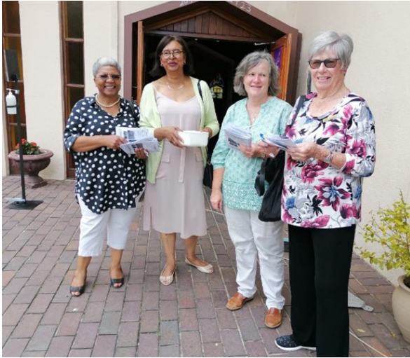
Victory Park CWL welcoming ladies to the WWDP