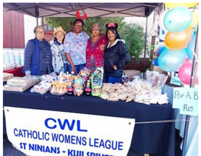
CWL Kuilsriver, Cape Town at their food fair