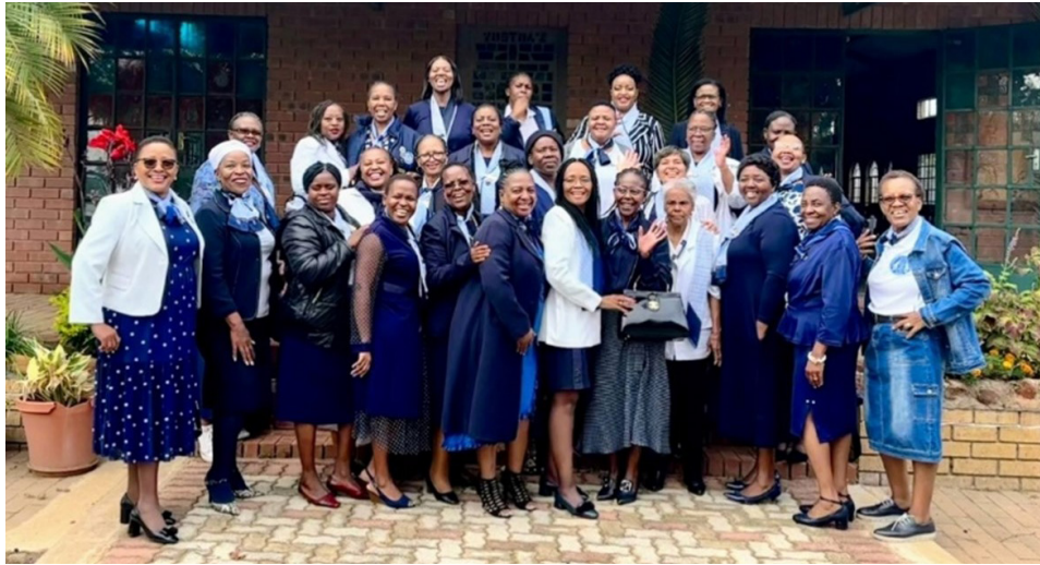
Pretoria diocesan members on a recruitment drive in Zone 4 GaRankuwa on 7 May 2023.