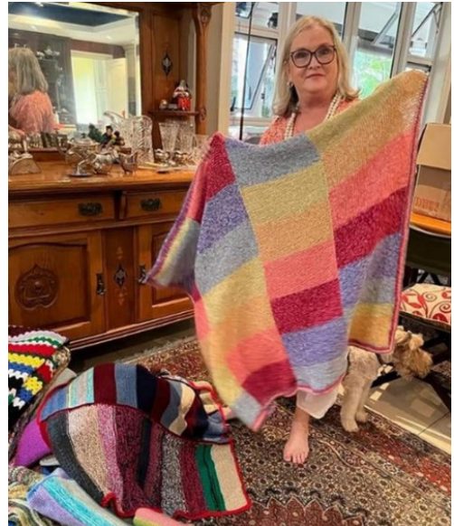
Blankets knitted by CWL members of Our Lady of Fatima, Durban North.