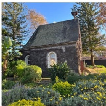
Beautiful Schoenstatt, Cape Town