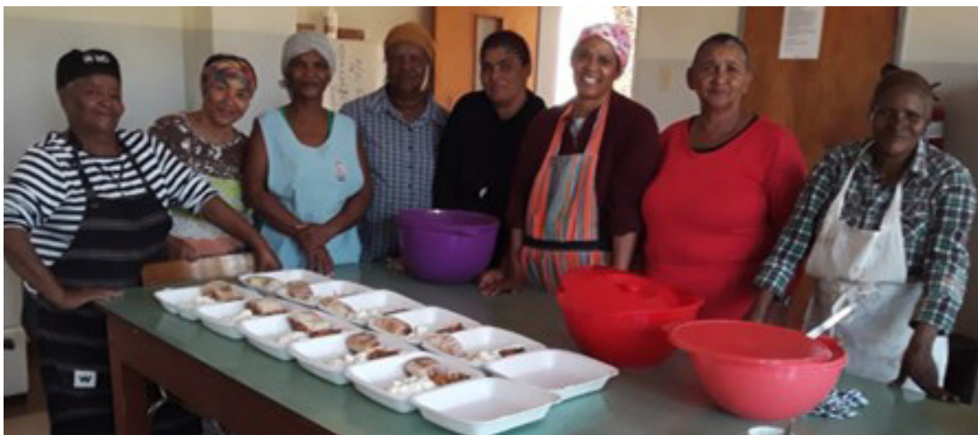
CWL at St. Konrad's, Dysselsdorp, preparing for a function.