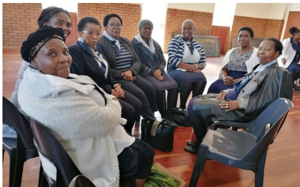
CWL Maryvale ladies enjoying refreshments after the Mass.