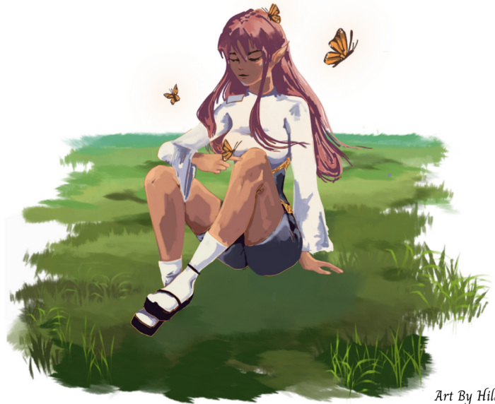
Art By Hilary Glev