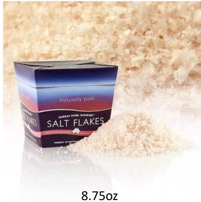
8.75oz (250gm) Chef Box