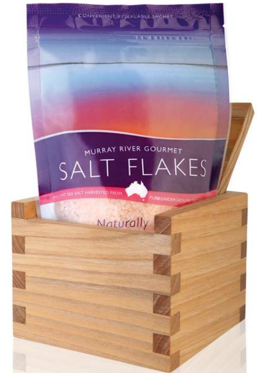
5.291oz (150gm) Pouch