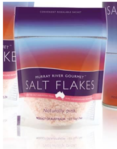
1.75oz (50gm) Pouch