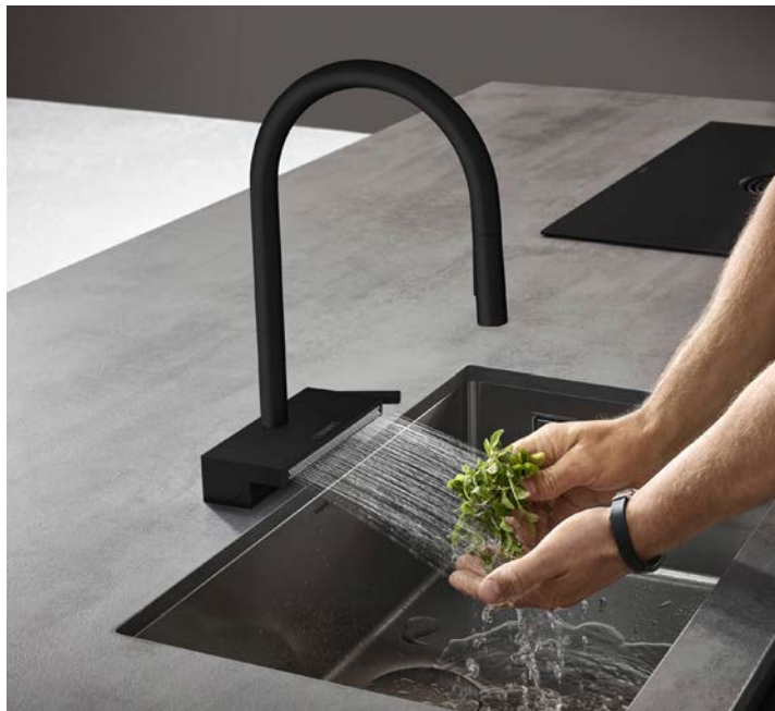
Left: Get a hose pull of up to 30 in. with sBox®, as shown here in the Talis® N HighArc Kitchen Faucet O-Style (Matte Black finish). Right: Use the Select button on the all-new Aquno® Select® HighArc Kitchen Faucet (Matte Black finish) to activate SatinFlow, the latest spray innovation from hansgrohe.