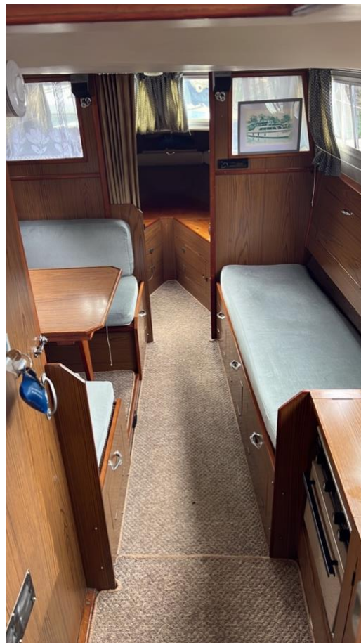
Sovereign has all the mod cons of heating, hot and cold water and fridge.