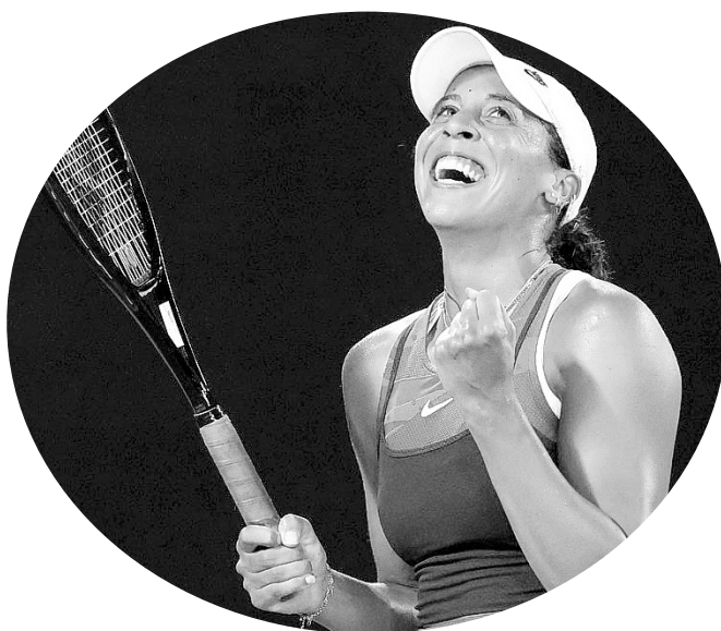
AMERICAN MADISON KEYS celebrating after winning her semi-final match against Poland's Iga Swiatek to reach the Australian Open final.

But the experienced Keys, competing in her third semi-final at the Australian Open , continued to heap the pressure on with heavy ball-striking and impeccable serving to race ahead 5-0 in the next set before Swiatek avoided the embarrassment of a bagel.