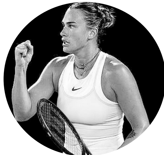
ARYNA SABALENKA powers her way into another Australian Open final.

Meanwhile, world No. 1 Sabalenka was also not perfect and trailed Badosa 2-0 in the opening set with a flurry of unforced errors, but she soon found her mark and put her dependable forehand to work to end the 11th seed's run in the Spaniard's first