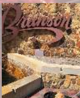
THE YELLOW ROSE