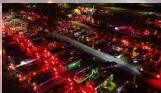
1,195 AIRSTREAMS ATTENDED!