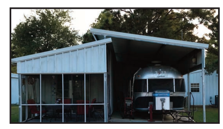
FOR SALE: Lots 20 & 22 Magnolia

Cabana and 1984 -31' Airstream trailer. Cabana has screened in front porch and 1 bedroom, 1bath, kitchen, large shower and family room. Lot has concrete pad and storage shed.