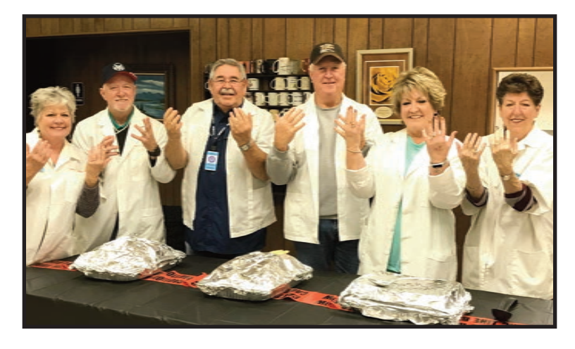
The Officers Host Group .. All Scrubbed Up to Operate... on serving Hot Food for the 9-1-1 Rally