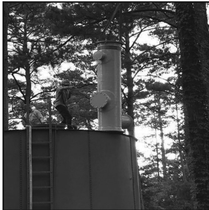
Engineers placing aerator on top of Water Tank

Make your plans to spend July 4th in the Park at TAHI. We are having a cook-out and our annual spectacular FIREWORKS display. Come be a part of the fun!