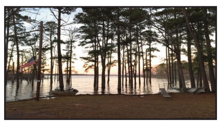
The Lake at Record Levels Photo of Lake at the corner of Angelina and Dogwood