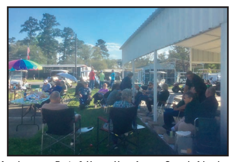
A going away Party & Happy Hour for our Canada friends