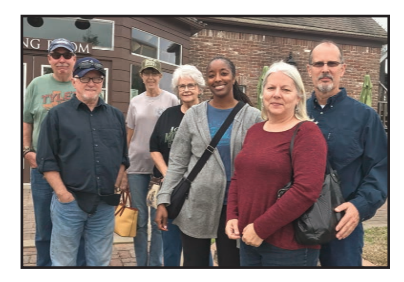
The group ready to tour Messina Hof Winery