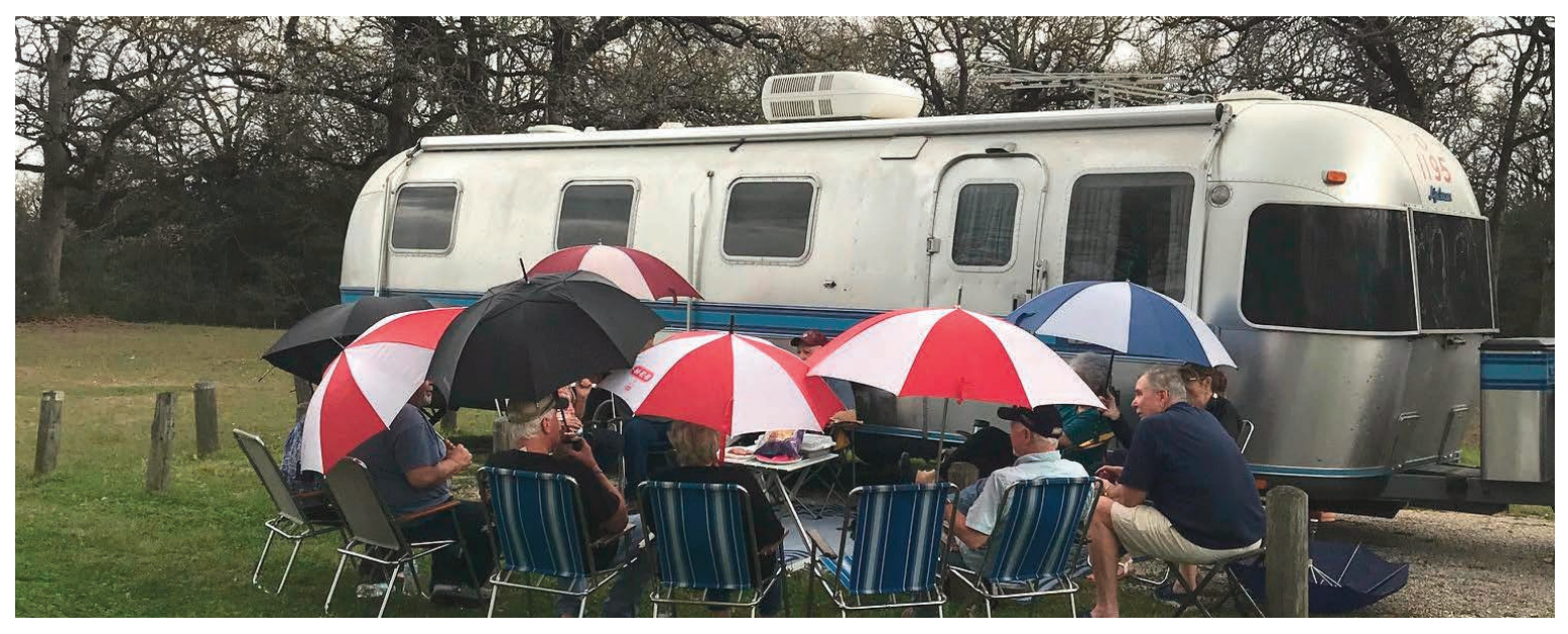
No awning?---No Problem---just break out the Umbrellas---Not Even the rain can stop a Happy Hour!