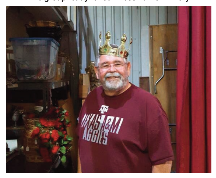
King Fred? --- Never leave a Crown Laying Around!