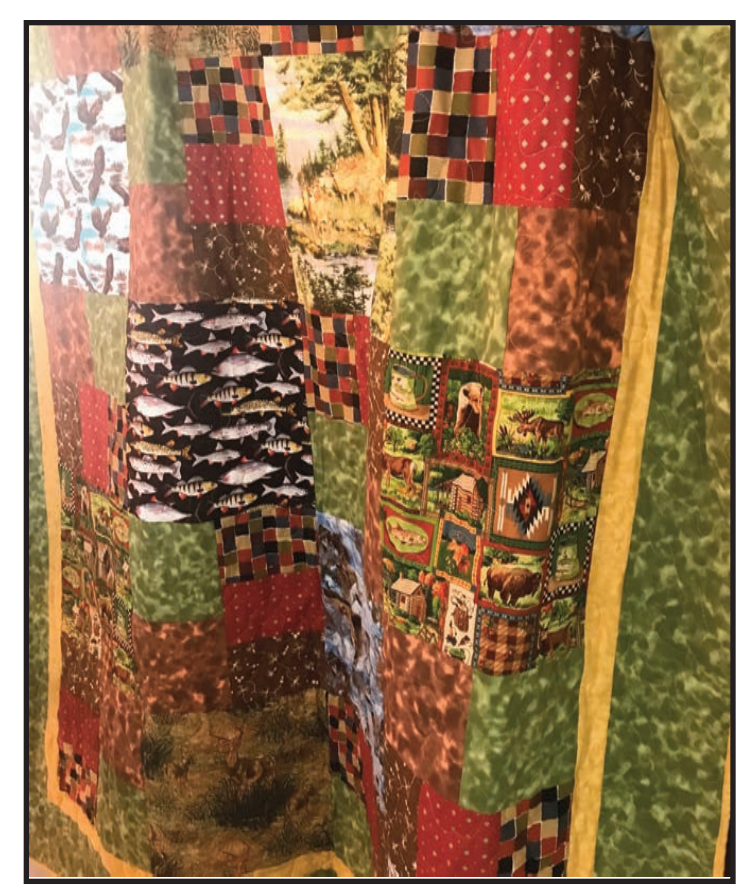
This twin size wildlife themed quilt will be up for bid at our fishing tournament rally. Silent auction bids open at $75 Friday morning. Bidding closes at potluck supper