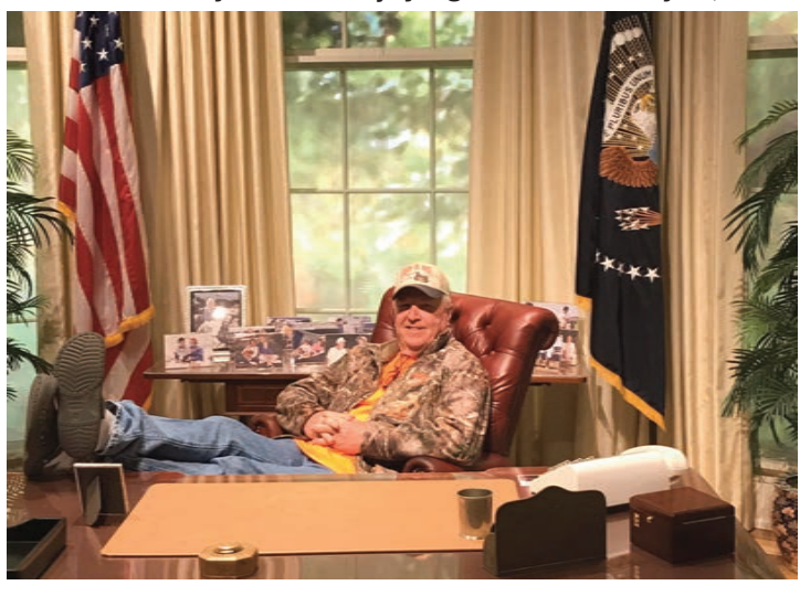
President Bill? --- "I could get used to this!"