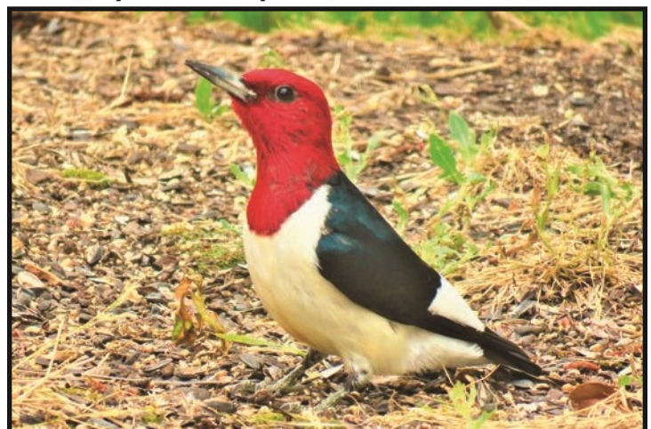
The Red Headed Woodpecker used to be somewhat rare in this area but in the last few years several have made TAHI their nesting spot before returning to Mexico for the winter.