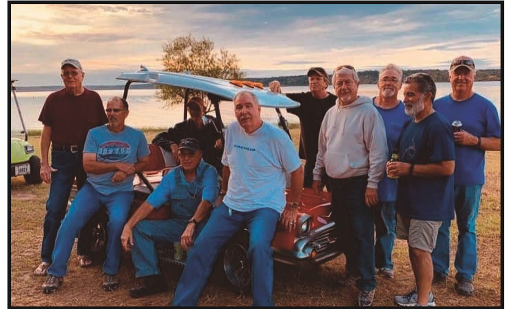
Fellowship! The Men & Ladies of TAHI + guests enjoying a pleasant evening & fire at Inspiration Point