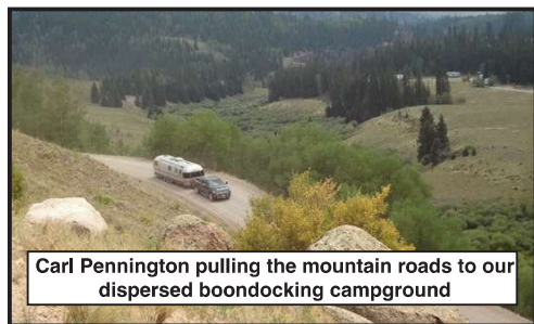
Carl Pennington pulling the mountain roads to our dispersed boondocking campground