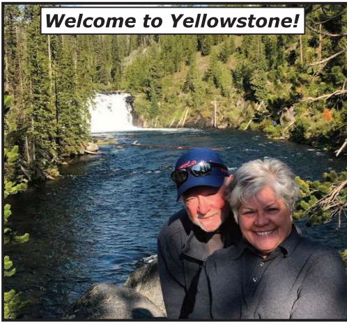
Lewis Falls at South Entrance to Yellowstone.

No one should travel all the way from Texas to Yellowstone and stay only 3 days, but that was all the time Randy and I had for this quick trip in mid-June. We planned the trip to arrive on the date that Madison CG in West Yellowstone opened having been delayed by Covid. This was the first and only NP campground to open in early June. Visitor centers were closed, and several roads were closed due to construction. We were able to see four of the five areas of the park, however, and were rewarded with small crowds and perfect weather. We entered from the Grand Tetons at the South entrance and spent the first two days exploring the Geyser Basin areas from the South and the West entrances. A beautiful walkway at the West Thumb Geyser Basin immerses you in geothermal activity. To walk along this small portion of the vast expanse of the 110 miles of Yellowstone Lake shoreline and see blue thermal pools steaming up through frigid lake water emphasizes the fragile and volatile surface of this area. Huge volcanic eruptions that occurred over the past 2 million years formed the geyser basins' striking landscapes. When the magma chambers beneath Yellowstone emptied, large surface depressions called calderas were formed. It takes more than two days to see all of the 150 geysers in