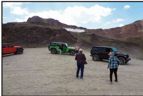
When In the Mountains...Jeep it!...a fun day exploring mountain passes as we "jeeped" over Cinnamon Pass, Elevation 12,600 ft... then over Engineers Pass in a big loop back to Lake City.