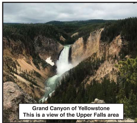
Grand Canyon of Yellowstone This is a view of the Upper Falls area