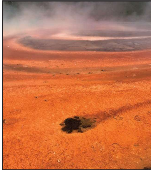
You think you are on Planet Mars but this is in the Grand Prismatic Geyser Basin area which contains 20% of the world's known geysers