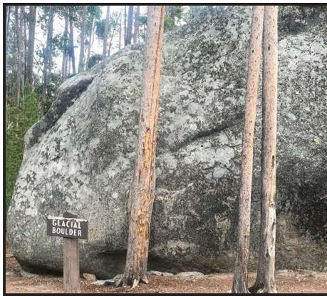
This boulder took a ride on a glacier and stopped here 83,000 years ago