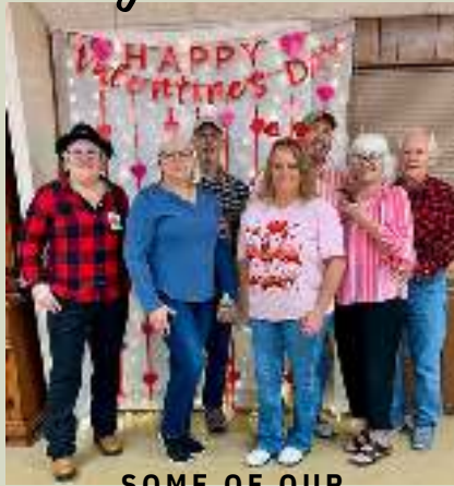
SOME OF OUR RALLY HOSTS