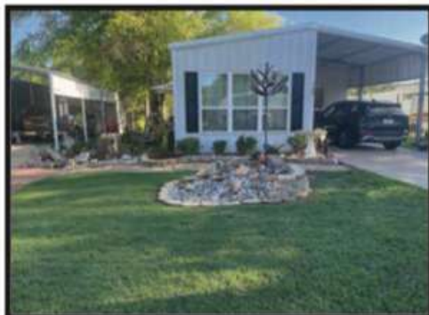
"Around the Park"