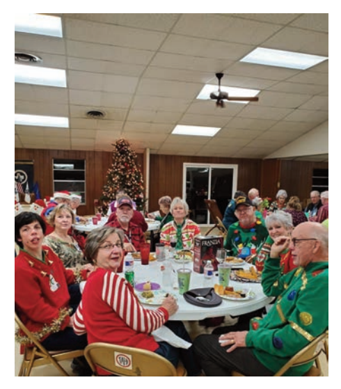
Christmas Pot Luck Dinner & Ugly Sweater fun