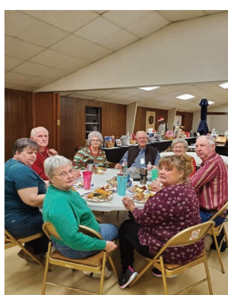
The Cooks and Hosts for the Installation Dinner