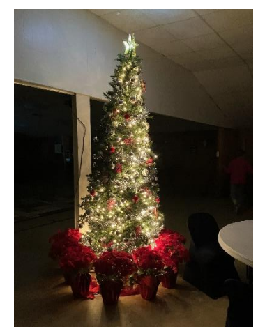
Christmas in the clubhouse