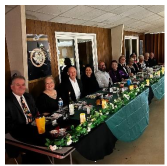
New TGCU board and spouses