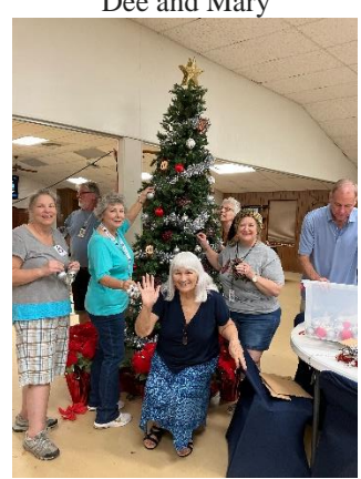
Trimming the Tree