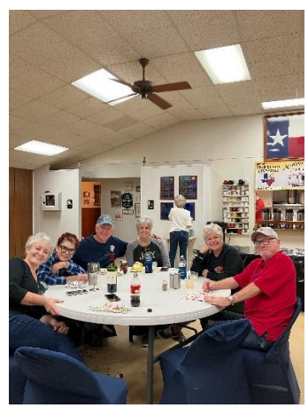
Gaggle of friends