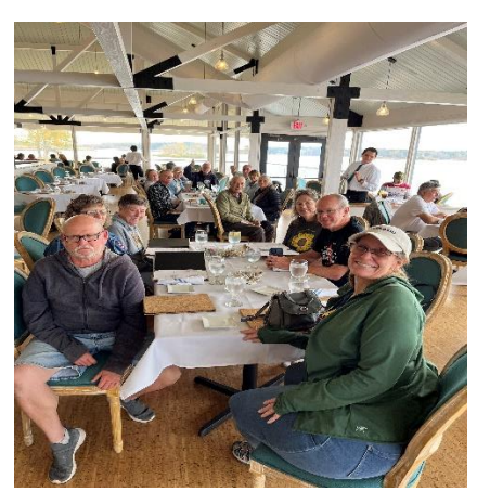
Mariners Restaurant in Natchitoches