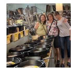
PANS! Natchitoches LA. Christmas Caravan

Merry Christmass and Happy holidays from TAHI and TGCU