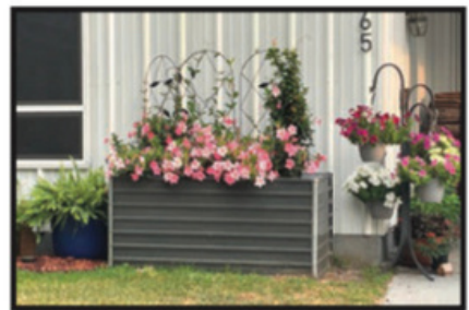
Here are a few more pictures around the park.