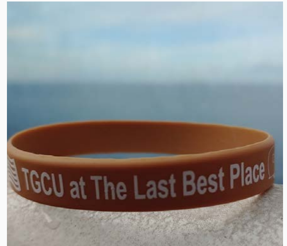
ON A CRUISE TO COZUMEL - SELINA SHADD