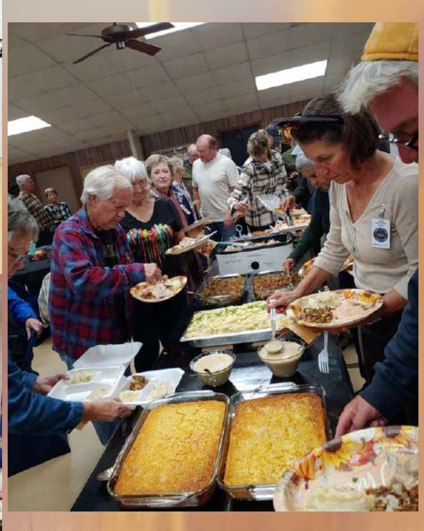
TURKEY DINNER AND HONORING ALL OUR VETERANS & SHARING BLESSINGS