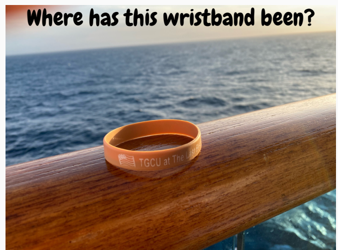
Where has this wristband been?