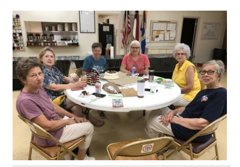
Ladies Lunch Bunch at the Clubhouse