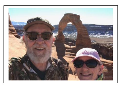
Delicate Arch at Arches, NP