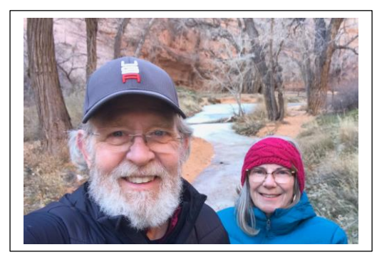
We've been to Arches, Canyonlands & now Capitol Reef. Having a blast!