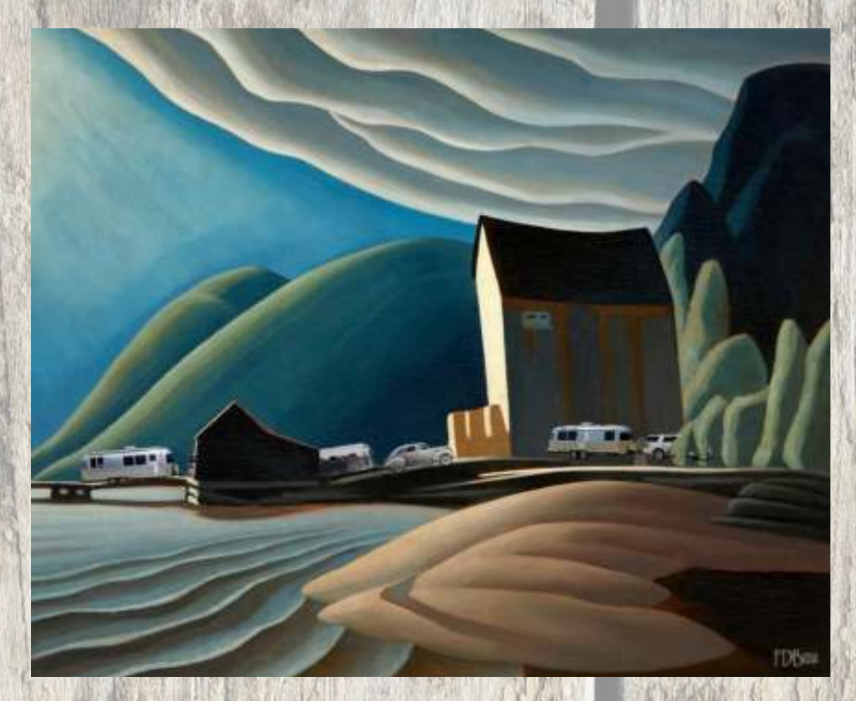
AIRSTREAM ART BY FRANK DIBONA