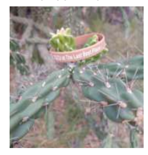
BIG BEND - SELINA & STEVE SHADD