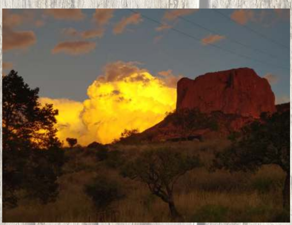
CASA GRANDE AT SUNSET BIG BEND NATIONAL PARK