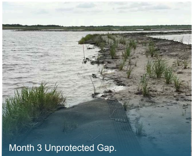
Month 3 Unprotected Gap.