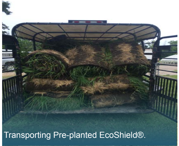
Transporting Pre-planted EcoShield®.