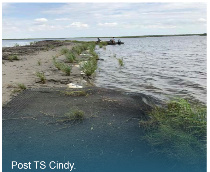
Post TS Cindy.